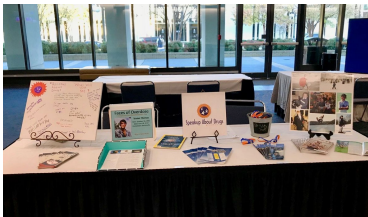
Central Arkansas Drug Summit