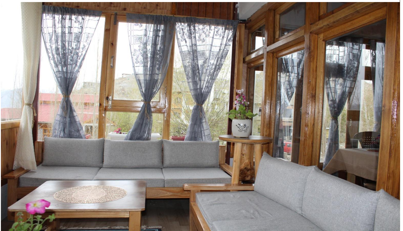
THE SPACIOUS COMMON LIVING AREA