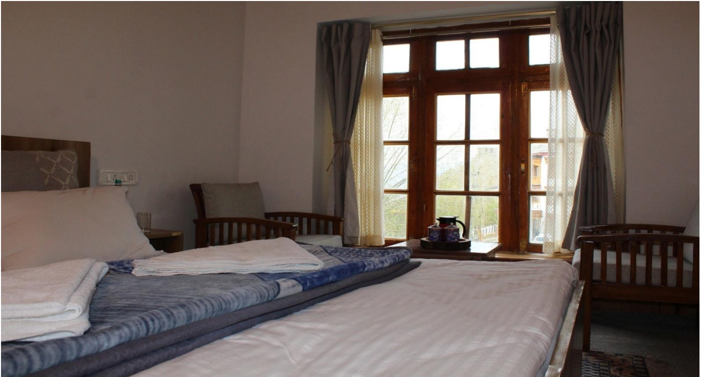
DELUXE ROOM WITH MOUNTAIN VIEW: ONE KING BED WITH PRIVATE BATHROOM