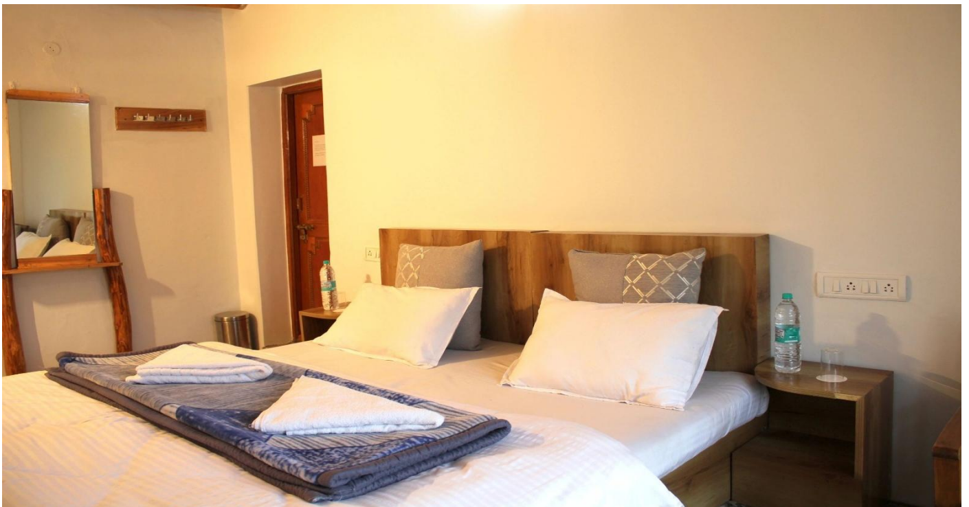
DELUXE ROOM WITH MOUNTAIN VIEW: ONE KING BED WITH PRIVATE BATHROOM