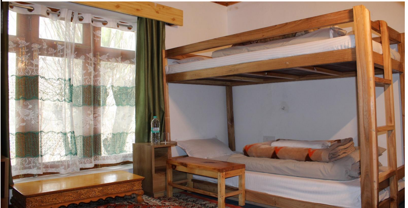
FAMILY ROOM WITH FOUR BUNK BEDS AND SHARED BATHROOM FACILITIES