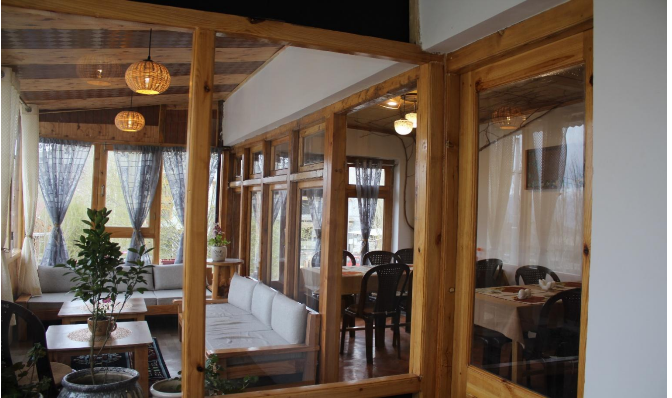
THE COMMON LIVING SPACE AND DINING ROOM