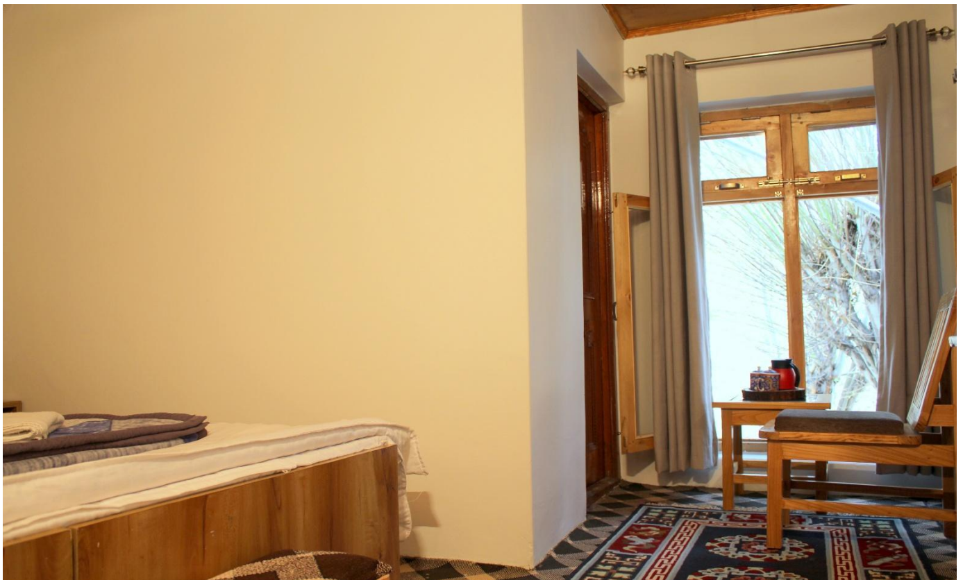
DELUXE ROOM: ONE KING BED WITH PRIVATE BATHROOM