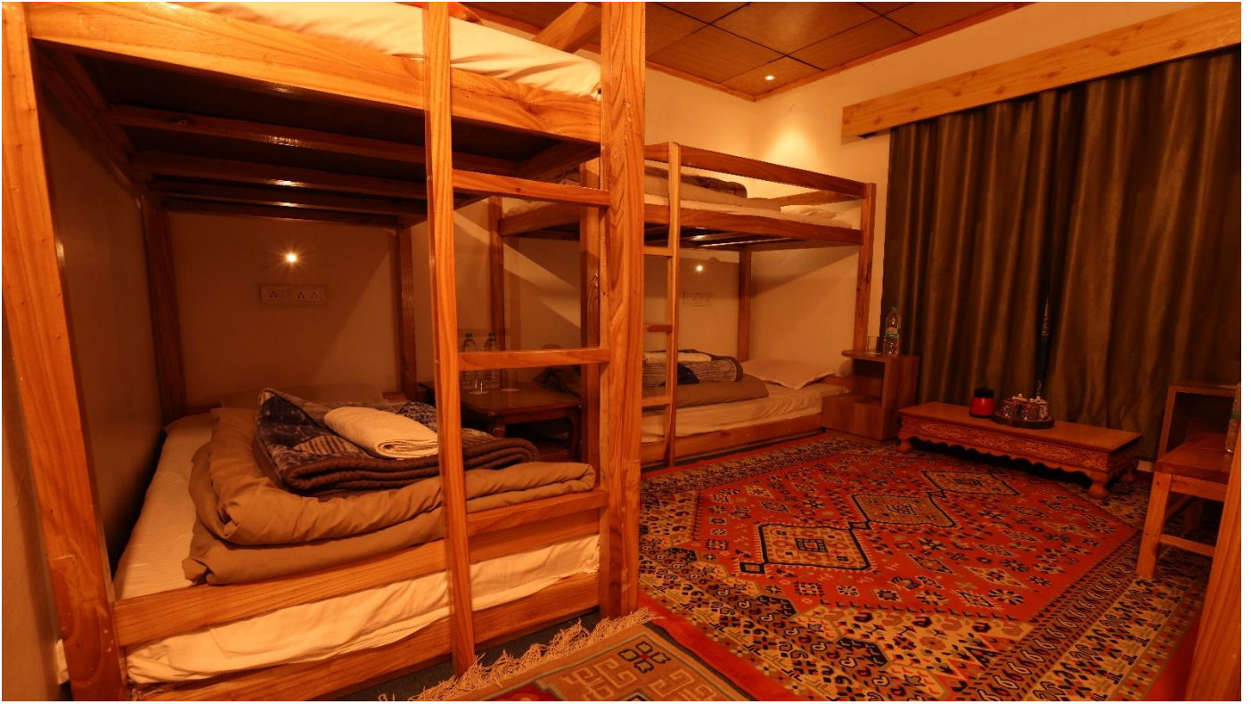
FAMILY ROOM WITH FOUR BUNK BEDS AND SHARED BATHROOM FACILITIES