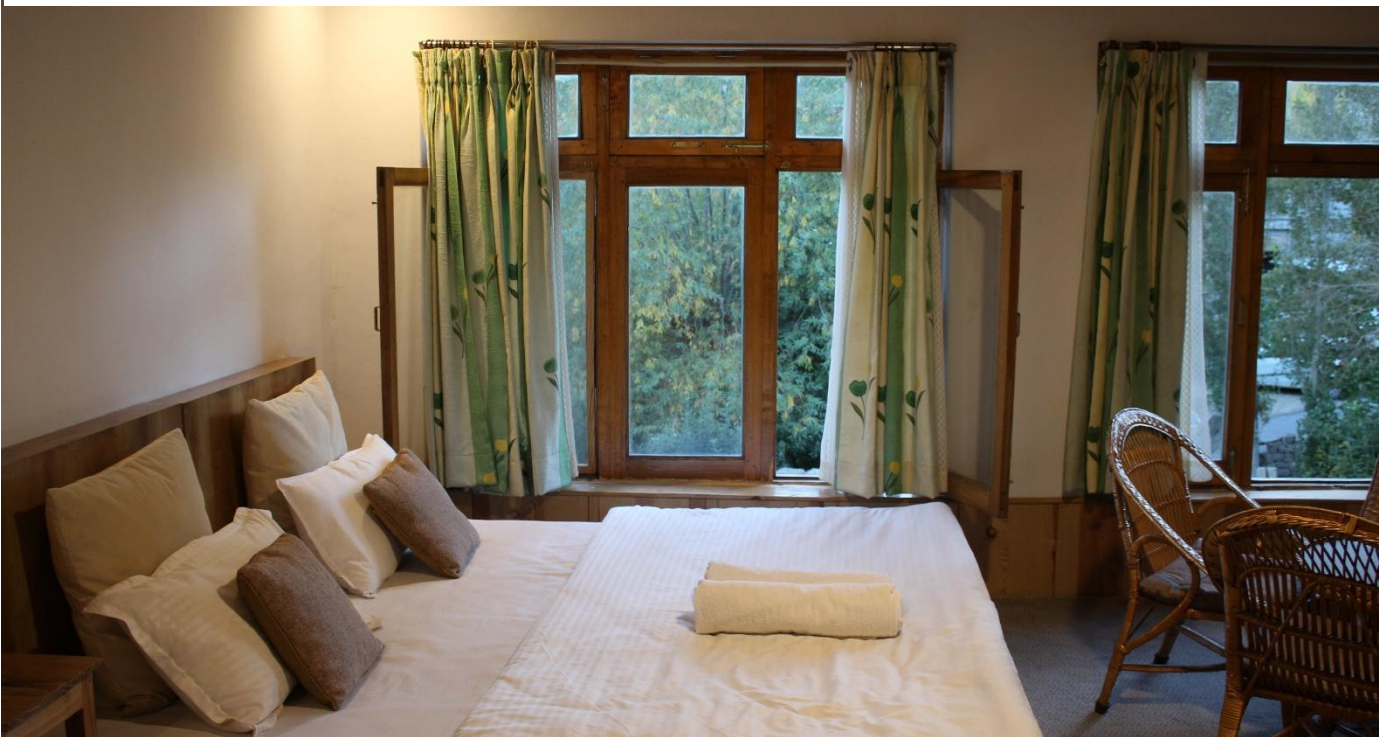
DELUXE FAMILY ROOM: TWO KING-SIZE BEDS, PRIVATE ATTACHED BATHROOM