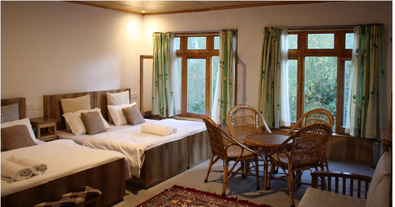
DELUXE FAMILY ROOM: TWO KING-SIZE BEDS, PRIVATE ATTACHED BATHROOM