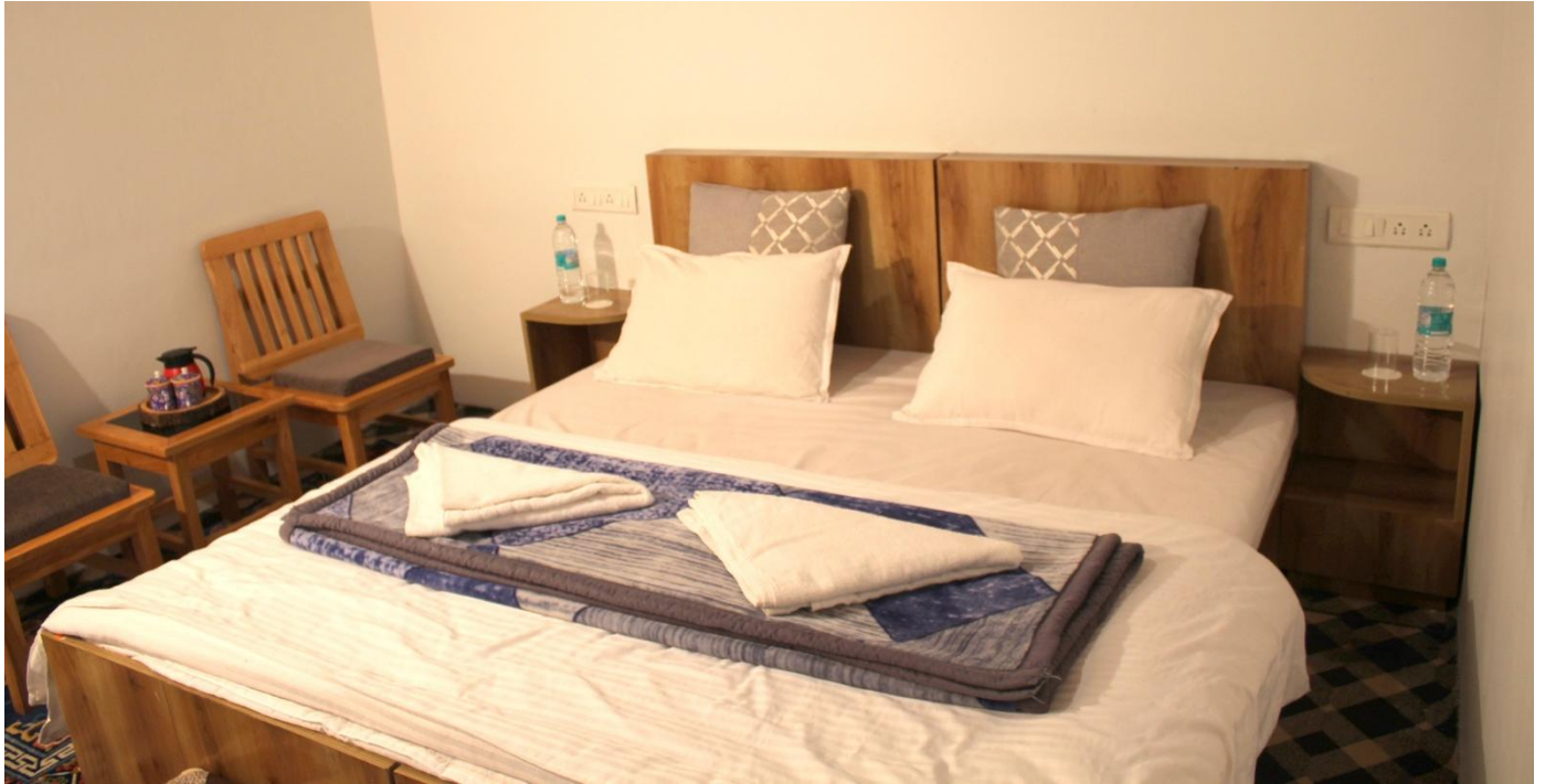
DELUXE ROOM: ONE KING BED WITH PRIVATE BATHROOM