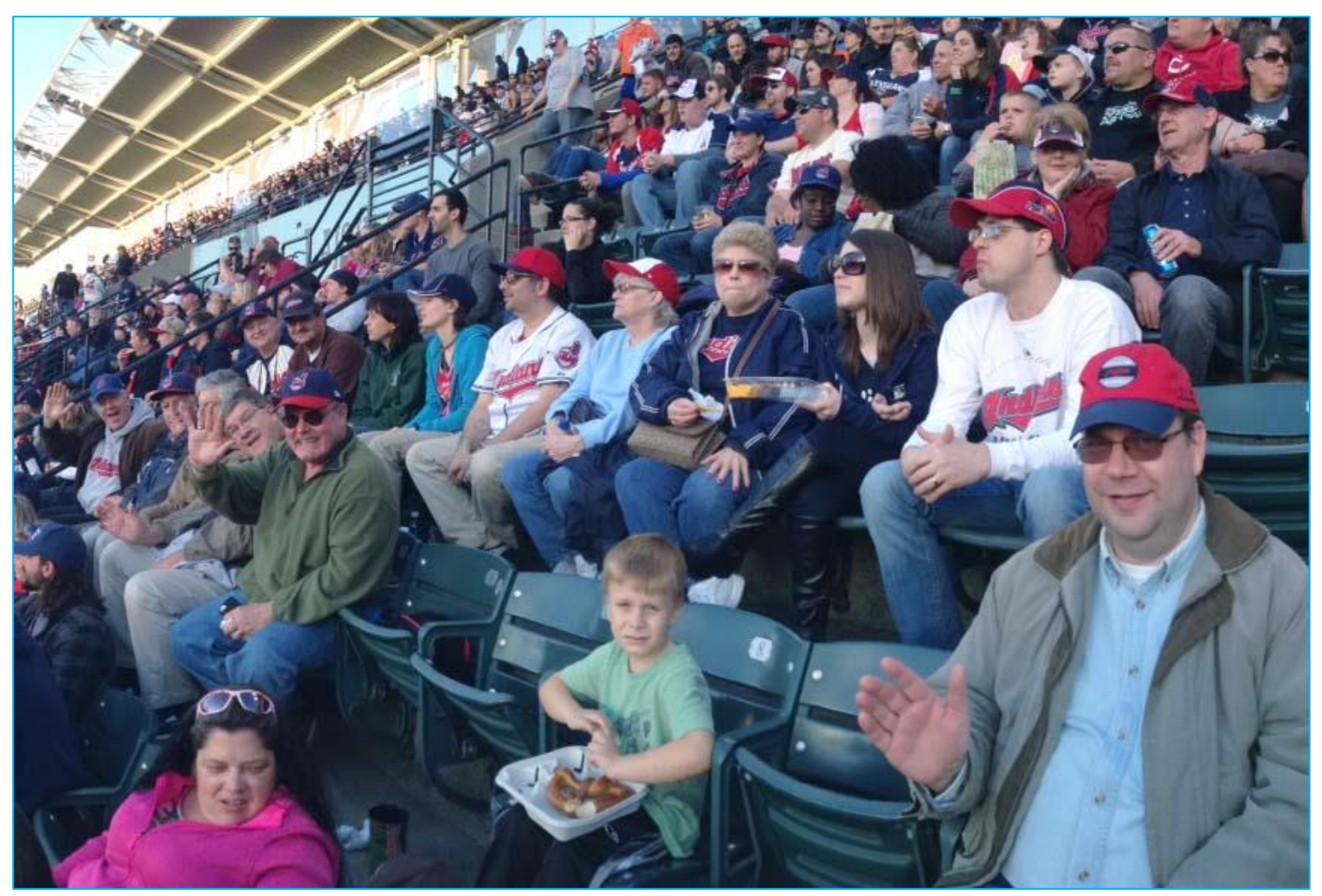
Members of the AIAA Northern Ohio Section along with family and friends attended a group outing at Progressive Field to watch the Cleveland Indians defeat the Cincinnati Reds on May 22.