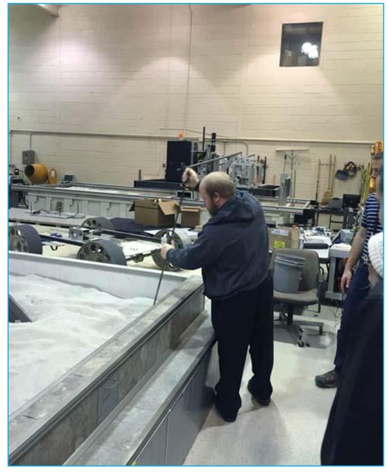
Demonstrating the consistency of the simulated lunar soil in the soil tank.