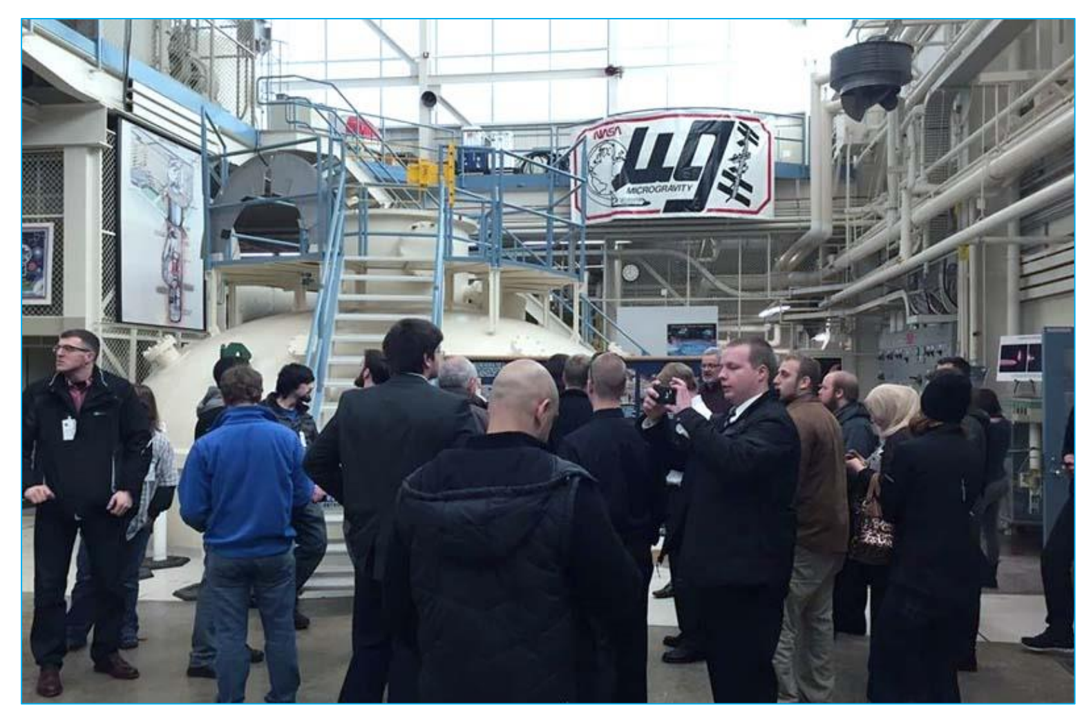
University chapter students visiting the Zero Gravity Research Lab during a facilities tour of NASA Glenn Research Center coordinated by the AIAA Northern Ohio Section. The Zero-G Lab is NASA's premier facility for ground-based microgravity research, and the largest facility of its kind in the World.