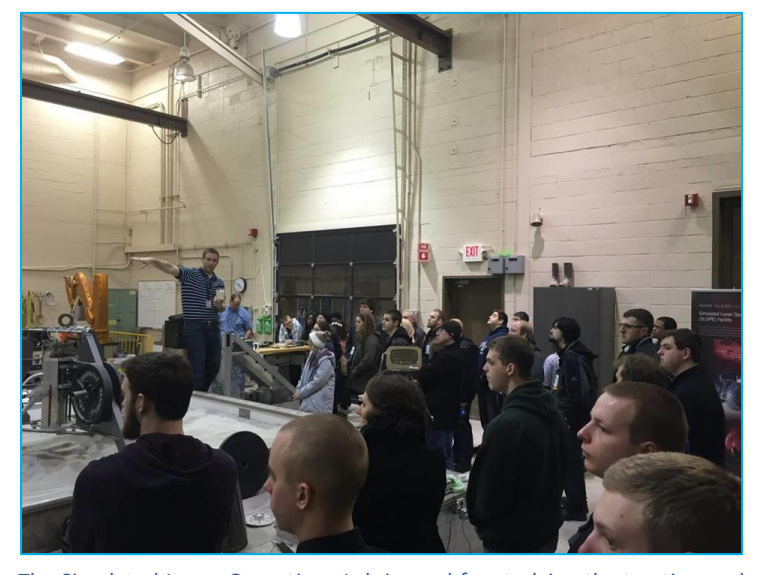
The Simulated Lunar Operations Lab is used for studying the traction and power consumption of lunar vehicles operating in lunar soil.

on a continuing basis, the decision was made by AIAA NOS to make this tour an annual event. In addition, NOS decided to support area students' participation in this year's AIAA regional conference through a travel stipend. Finally, in the time period since the tour event, the University of Akron was able to establish an official AIAA student chapter.