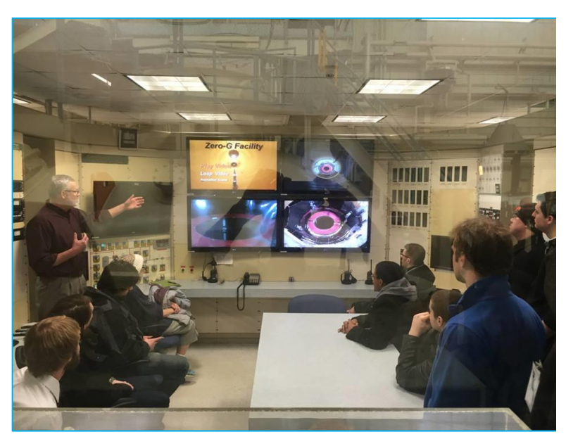
Student participants from area colleges gained insight into the operation of the control room at NASA Glenn's Zero Gravity Research Lab.

The AIAA Northern Ohio Section (NOS) supported the area AIAA University chapters by organizing a tour of the NASA Glenn Research Center facilities on March 11, 2015. This event was leveraged as a recruiting activity for the University chapters and attracted participants from Cleveland State University, Kent State University and Kenyon College. AIAA NOS coordinated with test engineers in NASA's Facilities Directorate to put on a tour that included the Simulated Lunar Operations (SLOPE) Lab, the Zero Gravity Research Lab, the 10x10 Abe Silverstein Supersonic Wind Tunnel and the Electric Propulsion Laboratory. These large facilities gave the students insight into the diverse research activities being conducted at NASA Glenn, and the importance of AIAA for publishing and dissemination technical knowledge.