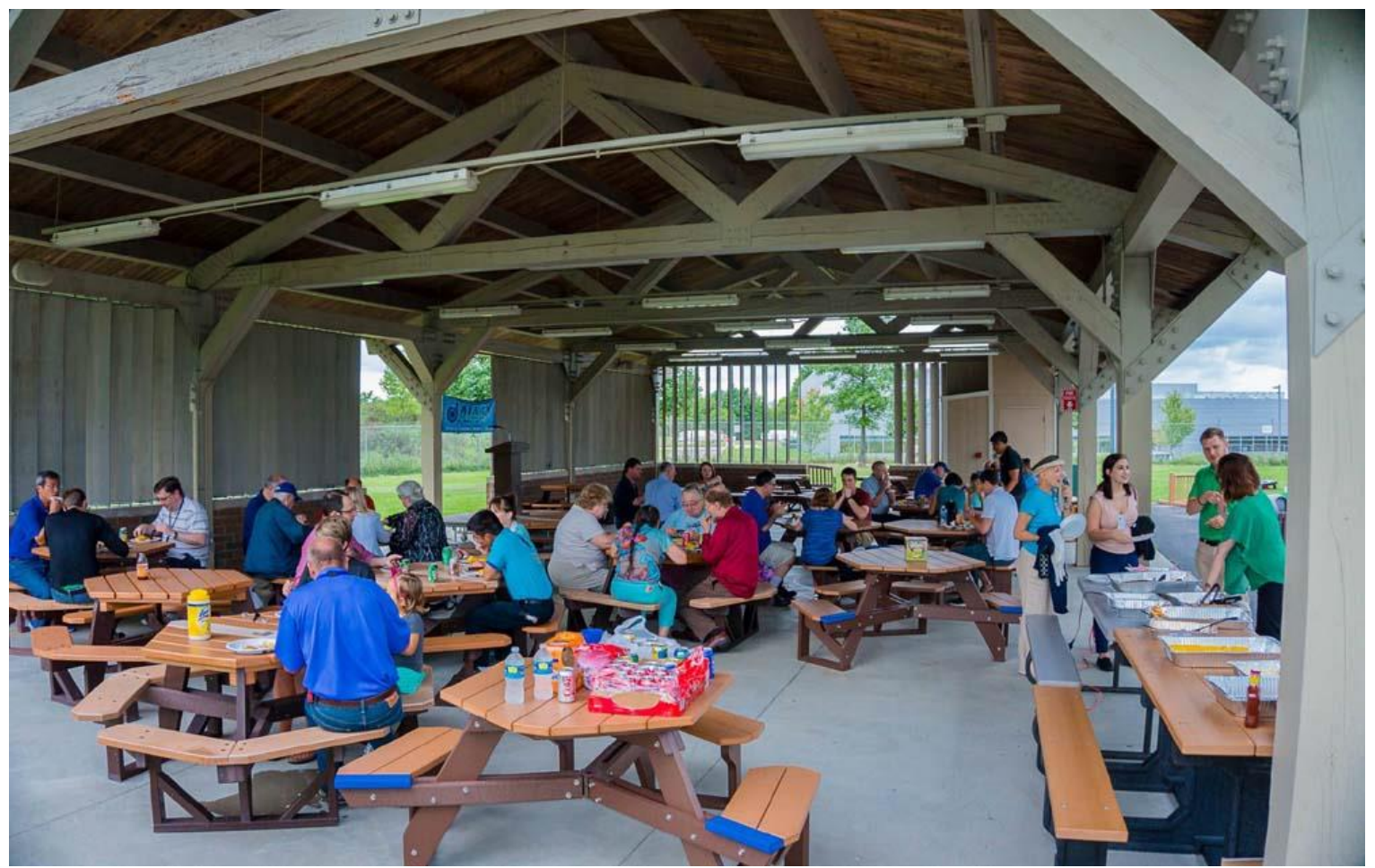
Approximately 50 attendees gathered at the NASA Picnic Grounds to recognize award recipients, celebrate accomplishments and enjoy a barbeque dinner.