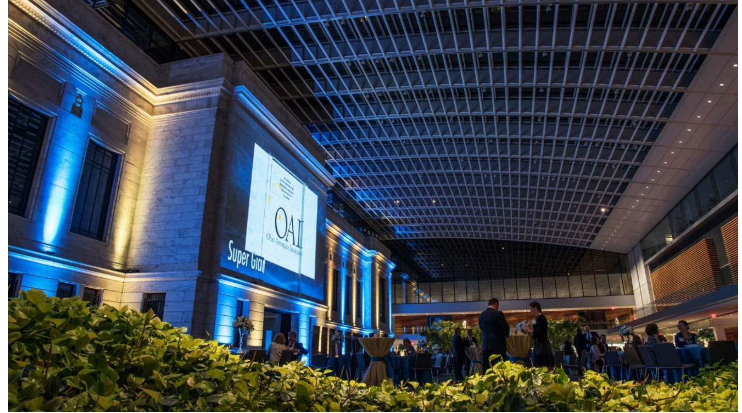
The Evening with the Stars reception was held in the beautiful Ames Family Atrium at the Cleveland Museum of Art.