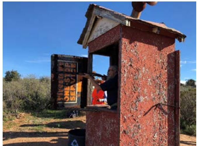
The outhouse shooting station

What made our club unique was the creativity of the shoot-