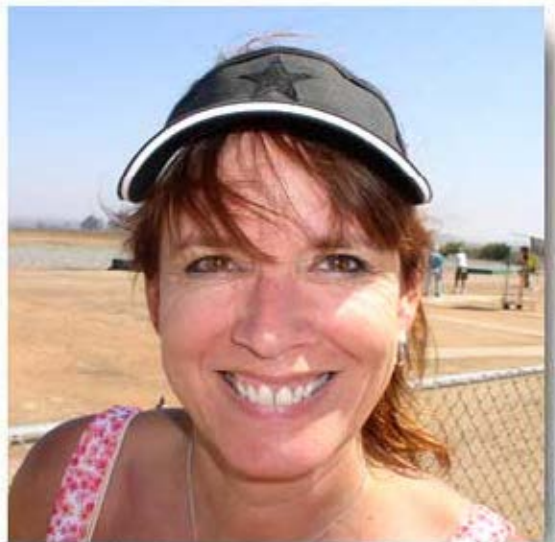
(Ginger's Dodge City Winning Smile)