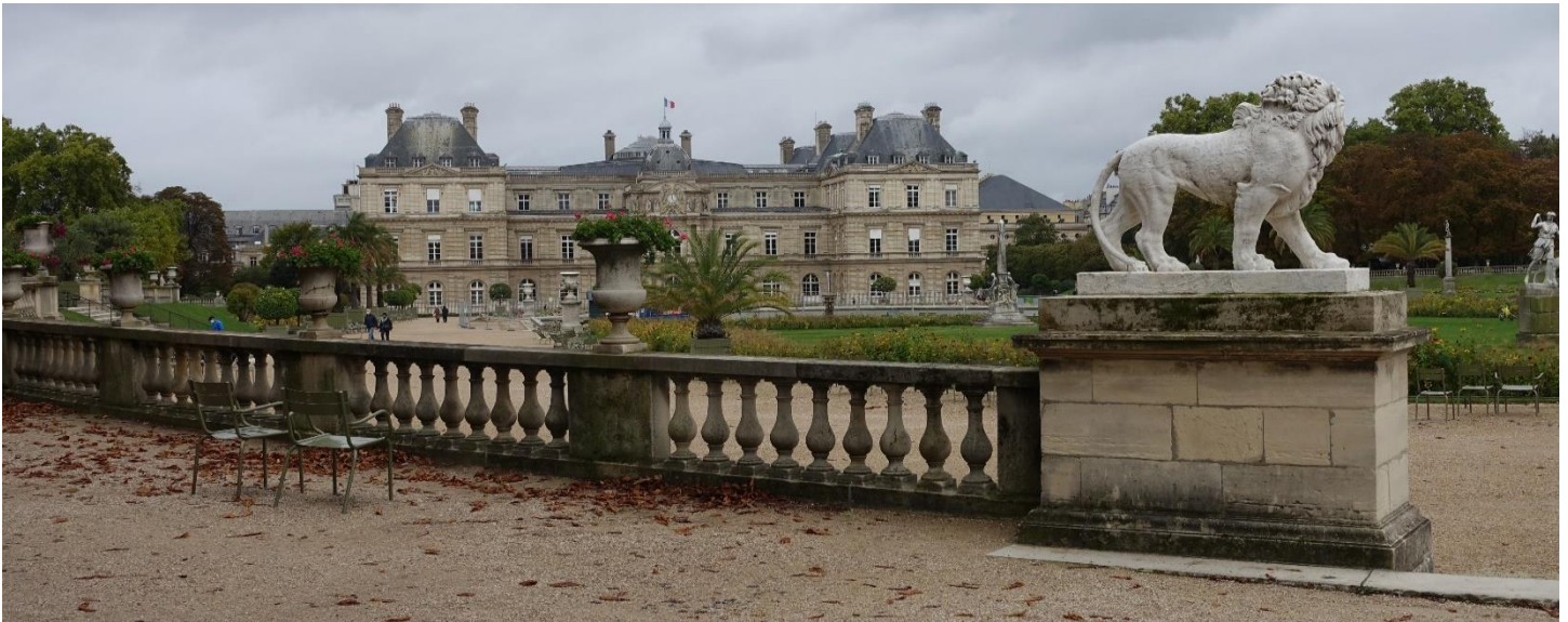
PALAIS DU LUXEMBOURG - THE FRENCH SENATE - OVERLOOKS A STATELY YET SERENE PARK

9am : FOLLOW CHARMING STREETS & TAKE UNEXPECTED DETOURS TO UNCOVER REAL PARIS