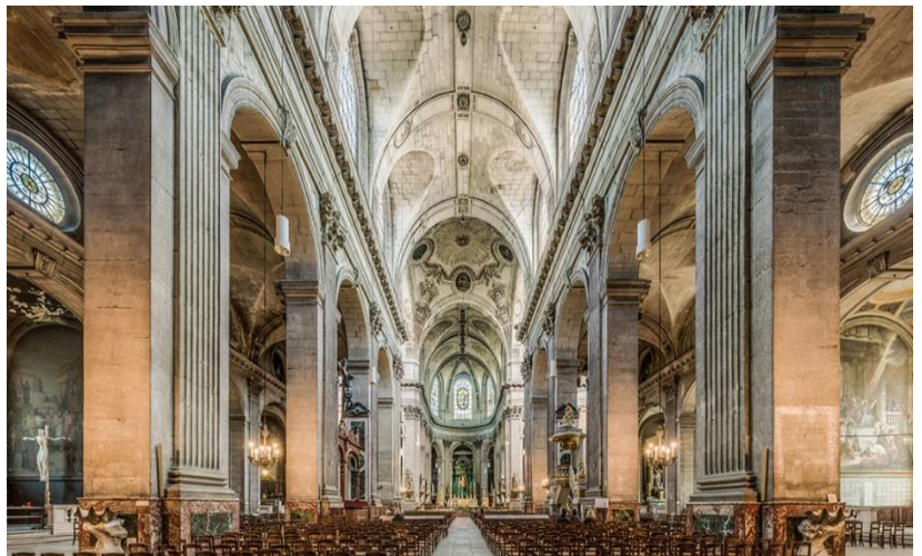
“EGLISE SAINT-SULPICE” IS THE SECOND LARGEST CHURCH IN PARIS AFTER NOTRE-DAME

1:00pm : LUNCH IN A CREPERIE TO SAMPLE A CRUSTY AND BUTTERY BUCKWHEAT GALETTE