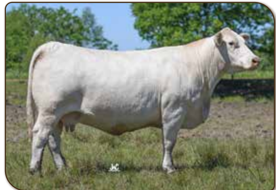
M6 Ms 0383 Mamie 764 ET | Dam of Lot 9

Lot 8A | Heifer Calf, born 2/21/21, sired by CCC WC Resource 417 P