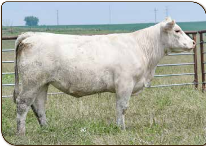
Lot 54 | SAS Ms Cool Shauni 017 P