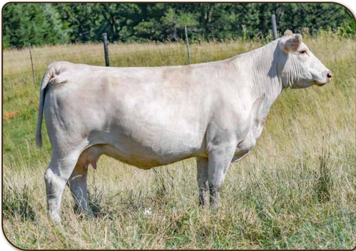
Lot 6 | M&M Ms Cool Rep 5582 ET