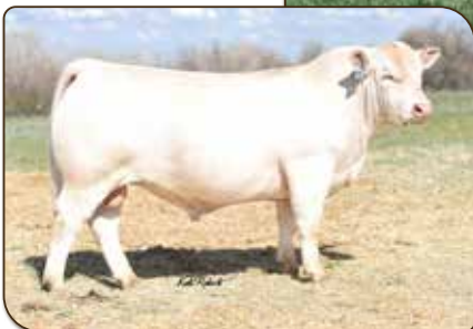
PVF Ridge 7142

5124 was an outstanding Donor for the Vaughan Family Ranch of KS before Sellhorst Charolais was able to acquire her this spring. A daughter of the incredibly profitable Jewel 0155 cow family, 5124 brings a proven pedigree backed by outstanding performance. She currently ranks in the top 1% of the breed for WW, YW, and TSI. This mating to the exciting outcross PVF Ridge could yield truly exciting results.