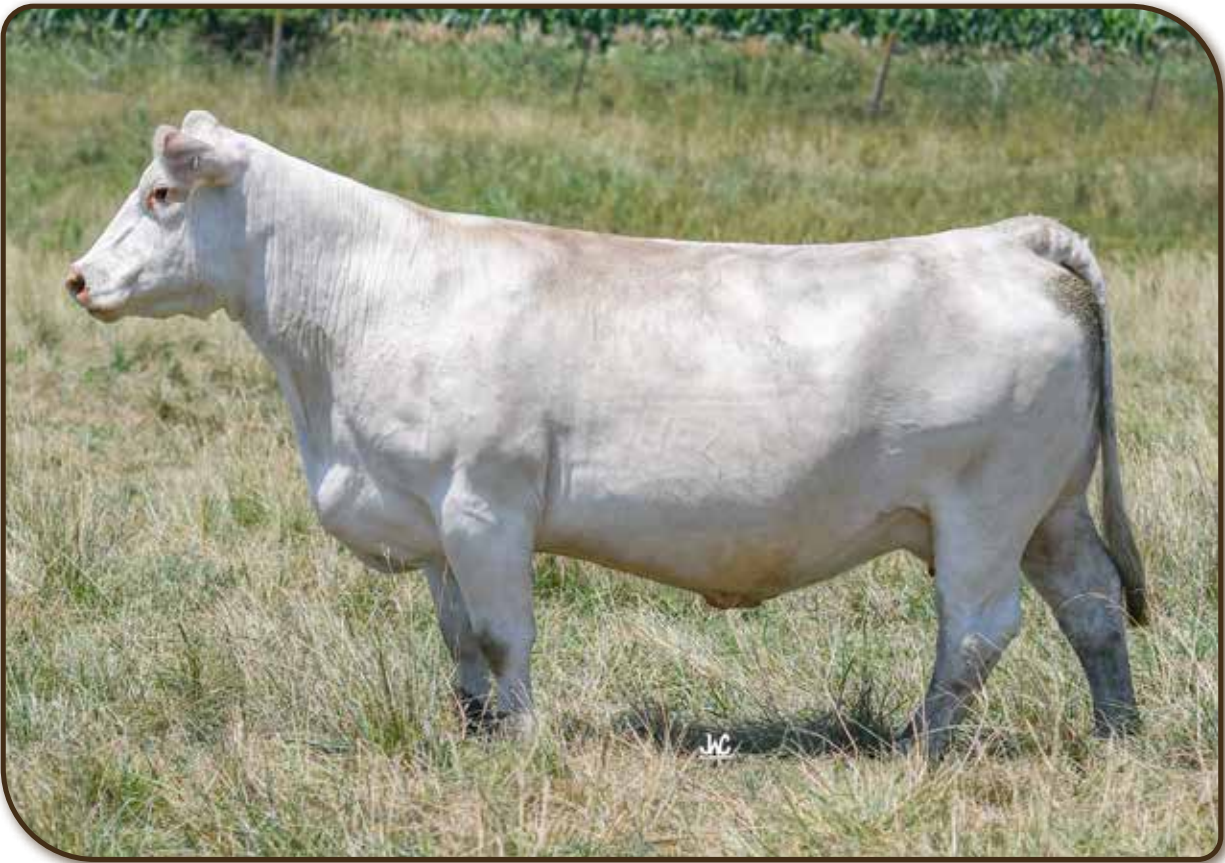
Lot 4 | M6/ROR Jewel Bell 656P ET