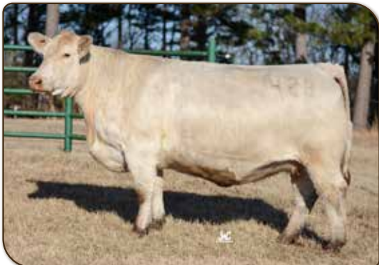
M6 Ms Jewel 428 P | Cool Rep x M6 New Jewel 0155

Lot 4A | Heifer Calf, born 2/19/21, sired by SAS Pendleton 9005