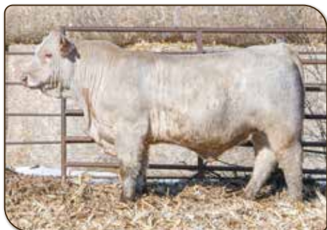
SAS Mask Mandate 9058