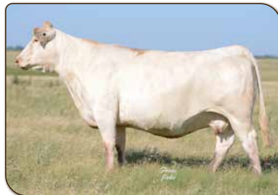
M&M Ms Stealth 8512 ET | Dam of Lot 6

Lot 6A | Bull Calf, born 2/18/21, sired by LT Patriot 4004 PLD