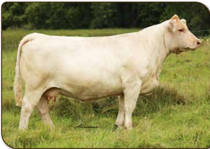
OBG Elvria 4303 Pld | Granddam of Lot 11 and Dam of Lot 10

Lot 10A | Bull Calf, born 2/21/21, sired by SAS Pendleton 9005