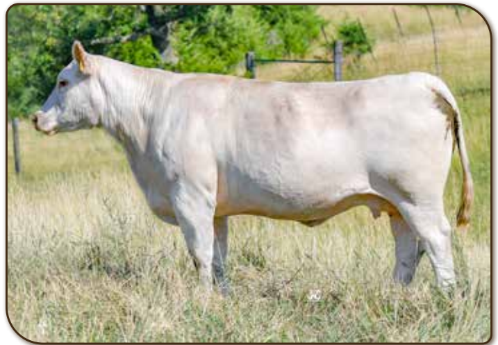
Lot 15 | Southern Lara 45563

A beautifully uddered Capital Gain daughter out of the great 248 donor. Her legacy can be found in the 183 progeny across the U.S. in herds such as Southern Cattle Company, Double-H Charolais and Fink Beef Genetics.