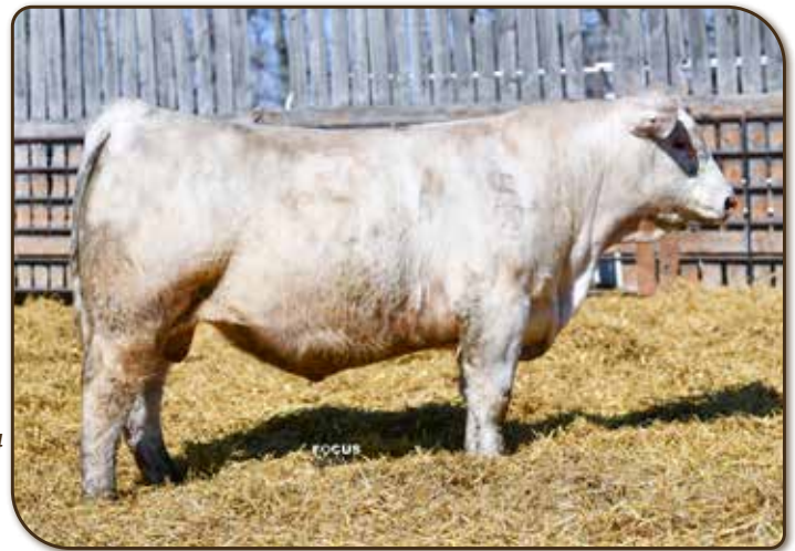
WCR Sir Tank 074 | Service Sire of many Spring Calving Cows

Lot 22A | Heifer Calf, born 2/25/21, sired by SAS Cool Ledger 8010