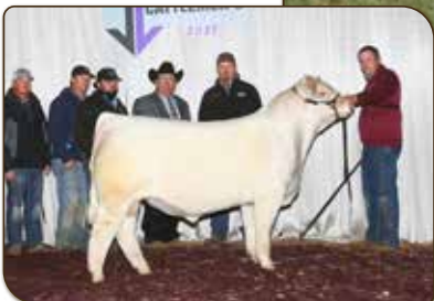
WIA Backwater Jack 060 P

RLL EATONS Miss Ledger 20533 P x M6 Grid Maker 104 PET THREE (3) IVF EMBRYOS