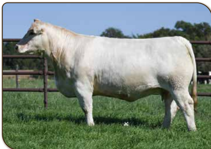
Summit Ms Hoo Dat C500 | Dam of Lots 56 and 57