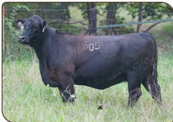
Lot 73 | SAS Ms Jackson Fate 2005

This Fate daughter offers more than just a balanced set of numbers. She is deep, soggy, and broody. If you are looking for the kind of females that can excel on fescue this is the kind.