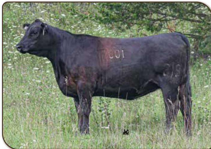
Lot 76 | SAS Ms Super Star Mag 2001

Last but not least, a daughter of a first calf heifer, Lot 76 boasts some of the best $ Values among the Angus offering and ranks in the top 4% for Milk and 10% for WW and YW.