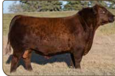
KJHT Power Take Off