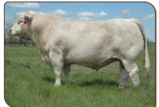
LT Bluegrass 4017 P