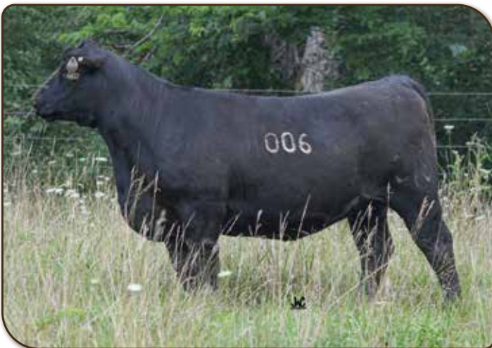
Lot 70 | SAS Ms Menlo Marshalla 2006

Easy fleshing and deep, this broody female reads pure cow power. She offers a balanced set of EPDs with a maternal skew.