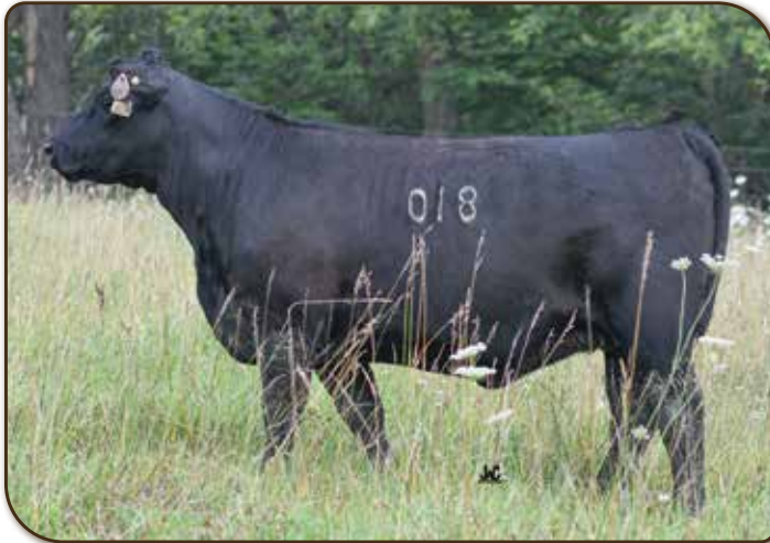
Lot 60 | SAS Ms Blackcap Heiress 2018

These bred heifers come from a registered herd that has been closed for more than 30 years. Sara and Dan purchased the herd at the beginning of 2020 lock, stock, and barrel from a local, retired vet, Rex Wilhelm. That operation was developed around a strong AI program followed by top clean-up bulls selected from within the herd itself (WFA prefix). Year after year, this was done building on a strong maternal foundation of cows that worked, along with a strong herd health program. You'll find these females are fleshy, bred with strong carcass traits, easy-calving, and with plenty of growth. These bred heifers carry the Shepherd-Shamburg brand and are the first group raised from this herd from birth to breeding. This herd calves, grows, breeds, and will continue that cycle in the timber pastures of Guthrie County as they have for over 30 years.