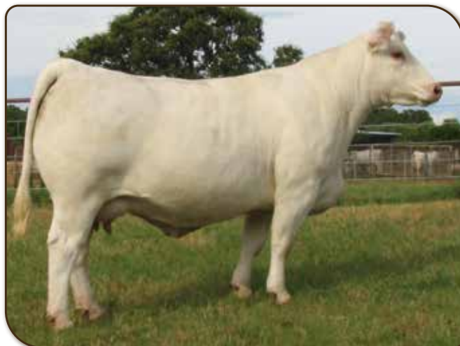
M6 Ms H45 Nancy 382 ET | Granddam of SAS Holy Commander and influence seen throughout this catalog