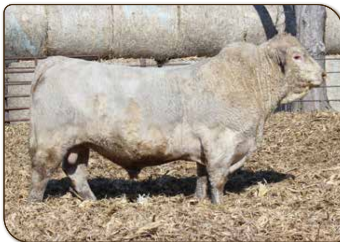
Southern Rio Bravo 35129 | Senior Herdsire at Shepherd Charolais

It's hard to find a pedigree more classic and profitable than 914 x Cigar. This mating has been and continues to be successful. Daughter sells in the bred heifer group as Lot 24.