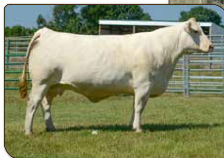
SC Miss Barbra 1142 P ET