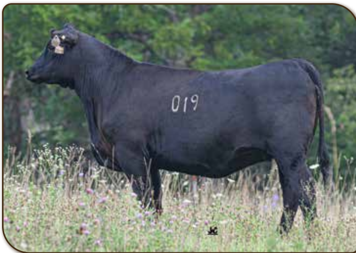
Lot 61 | SAS Ms Blackcap Heiress 2019

What a way to start off the Angus offering! Deep, long, and stout this female can work a lot of ways from clubby to purebred. One thing is for sure though she will work! Her maternal great-granddam is a Pathfinder and one of the favorite cows in the herd. 2018 ranks in the top 10% for Maternal Weaned Calf Value ($M).