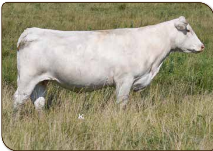
Lot 25 | SAS Ms Lady Wind Bells 757 PET