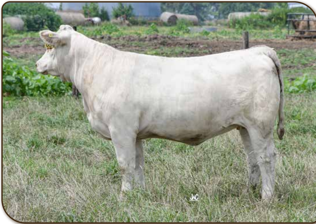
Lot 33 | SAS Ms Affinity Nancy 059