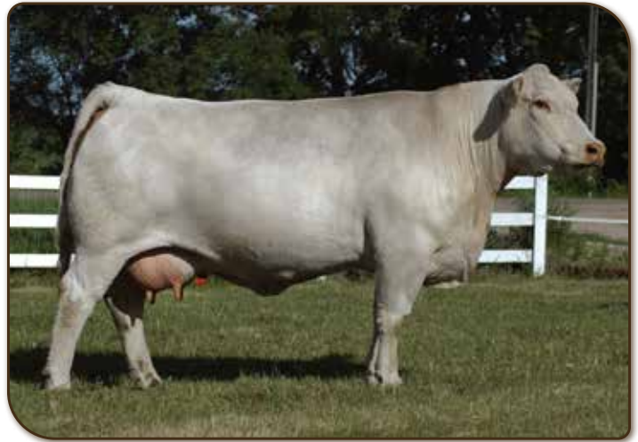
M6 Ms E46's Duke 248 PET | Dam of Lots 14 & 15

Lot 14A | Heifer Calf, born 3/2/21, sired by M6 Cool Rep 8108 or SAS Big Flirt 593A (View Supplement Sale Day)