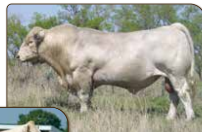
M6 Grid Maker 104 P ET