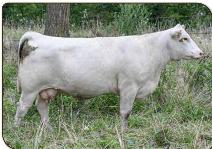
Lot 59 | DC Maria 9516 P