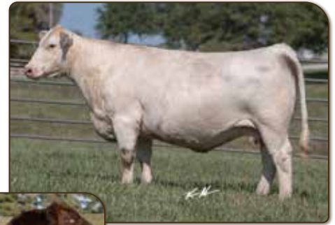
WC Crystal 9038 P

With the excitement surrounding both the Charolais and Red Angus breeds right now, it was just a matter of time before someone took it to the next step and created some exceptional percentage calves! Sired by the 2015 NAILE Grand Champion Red Angus bull and out of Shepherd's Crystal 9038 Donor. These calves could double register as a percentage in both breeds.