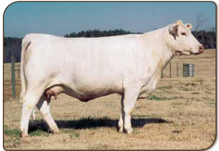
JWK Clarice J139 ET | Granddam of Lot 23

Lot 23A | Bull Calf, born 1/30/21, sired by LT Affinity 6221 Pld