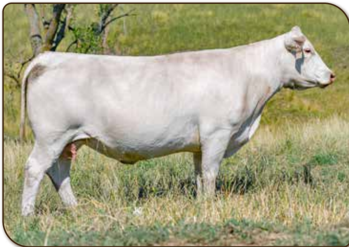
Lot 3 | Southern Clarice 55109