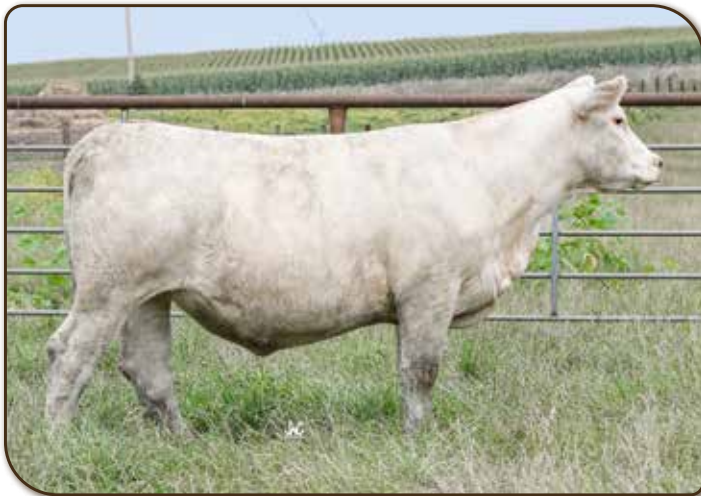
Lot 42 | SAS Ms Cool Bell Stone 962 P

An attractive young female who has all the pieces to the puzzle. Besides that front pasture look she brings the numbers to the table as well. Top 2% REA, 3% WW and MTL, 15% Milk and Marb, and 20% YW.