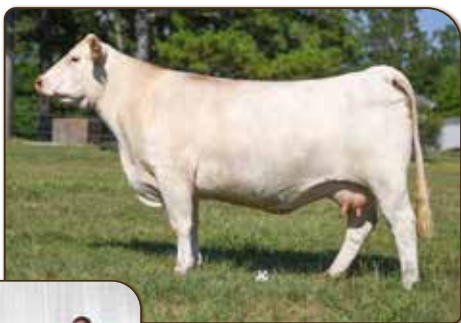
RLL Eatons Miss Ledger 20533 P