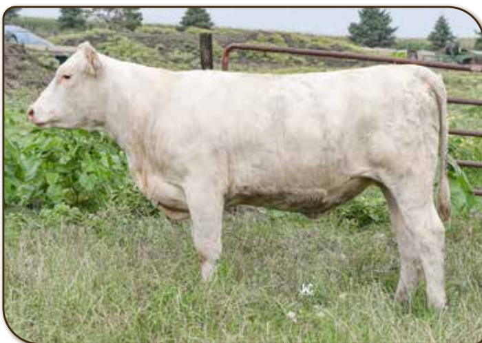
Lot 47 | SAS Ms Slamin Rocky Lady 956 P

A daughter of Lot 14, this is one not to miss. Cow power is stacked throughout her pedigree and the mating to Slam Dunk will only accentuate this!