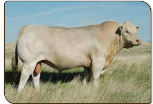
LT Ledger 0332 P