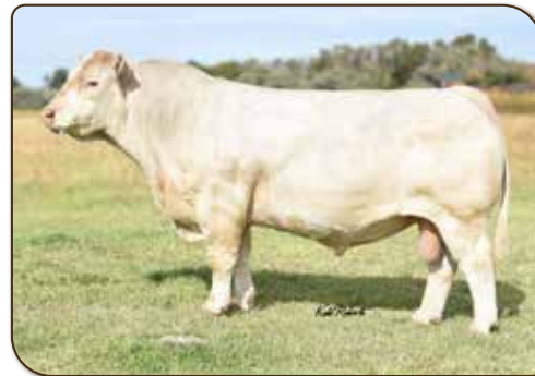
LT Patriot 4004 Pld

TR MR Fire Water 5792RET SEMEN | 1 STRAW