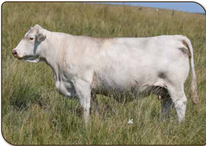
Lot 10 | EJ Elvira N Standard 222