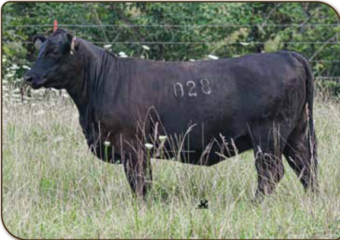
Lot 69 | SAS Ms Jackson Index 2028