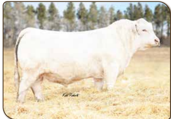
LT Affinity 6221 Pld | Sire of Lots 33-35

A powerful young female to start the Open Heifers. Her granddam sells as Lot 16 – a previous feature in the 37th National Sale. Affinity Nancy is a full sister to SAS walking heifer bull, SAS Virtual Happy Hour 9051.