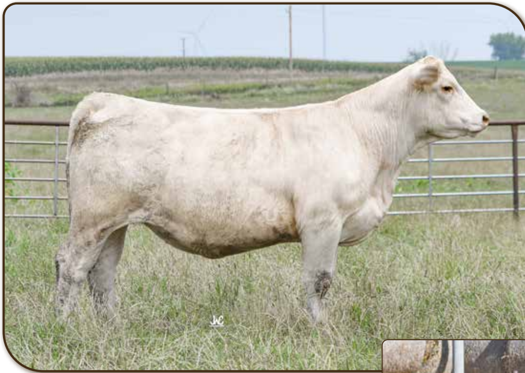
Lot 41 | SAS Ms Cool Bell Source 038PET