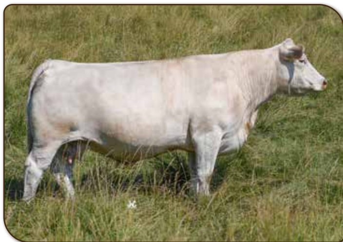
M6 Ms Cool Bell 550 P ET | Dam of Lots 36, 41 and 42