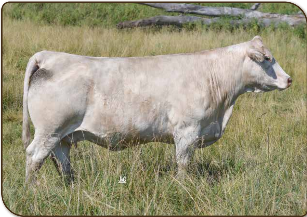
Lot 2 | RE-BARA Ms Cigar 409 ET