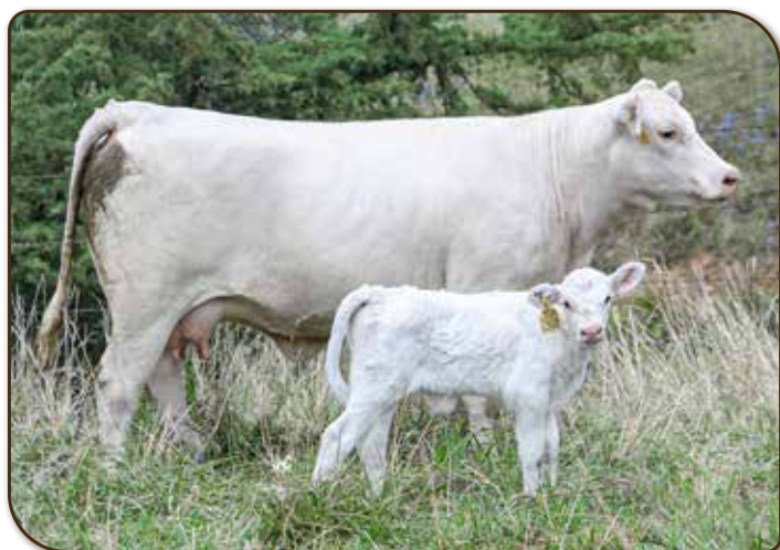
Lot 58 | DC Destiny 9520 P and Heifer Calf