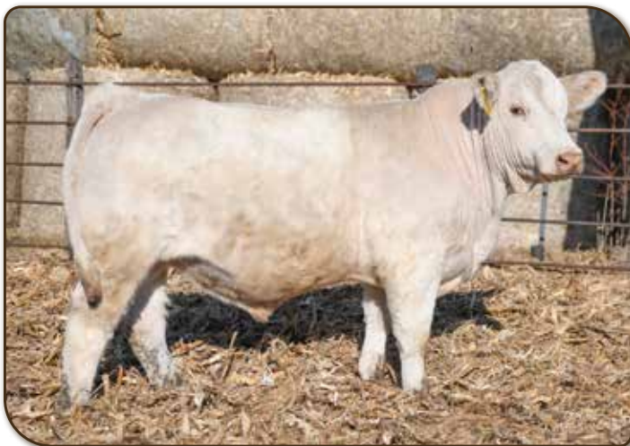
Son of Lot 12 | Sired by SAS Big Flirt

A daughter of Lot 10 - Elvira Standard is the culmination of two time tested Charolais Cow Families - the Patsy's and Elvira's. Sired by the $21,000 M6 Wrangler Yoda, Senior Herdsire for Shepherd Charolais. This young female exhibits great mothering instincts but unfortunately lost her calf through no fault of her own this spring.