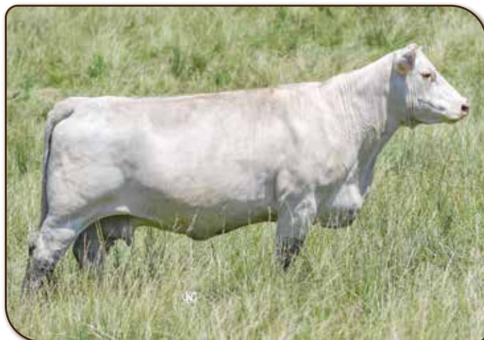
Lot 28 | SKS Nancy C907

Nancy C907's dam is a flushmate sister to the famous Nancy 6100 cow. With the mating to Ledger you can't go wrong. This female will fit nicely in someone's donor pen. She has a son working in a purebred herd in IA, a daughter retained in the herd, and a daughter is offered as Lot 37.