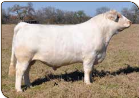
45th National Champion Bull BJCF Watt Z36

Full sister to 45th National Champion Bull, BJCF Watt Z36.