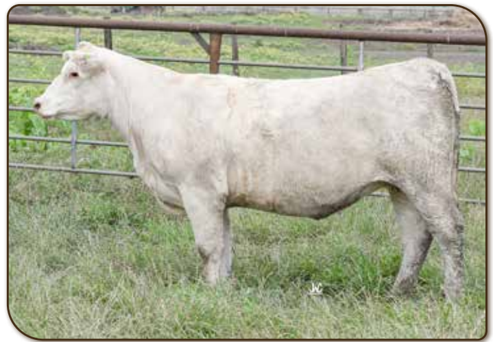
Lot 48 | SAS Ms Windy Out Source 959 P