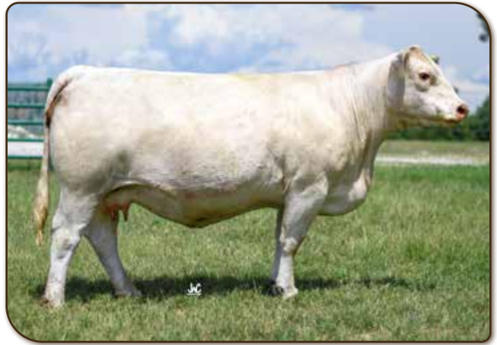
Lot 13 | BHC NWMSU 327 of 04 NS

Lot 13A | Bull Calf, born 4/4/21, sired by M&M Watt 6564 ET