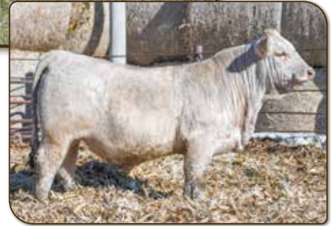
SAS Virtual Happy Hour 051 | Service Sire to Bred Heifers