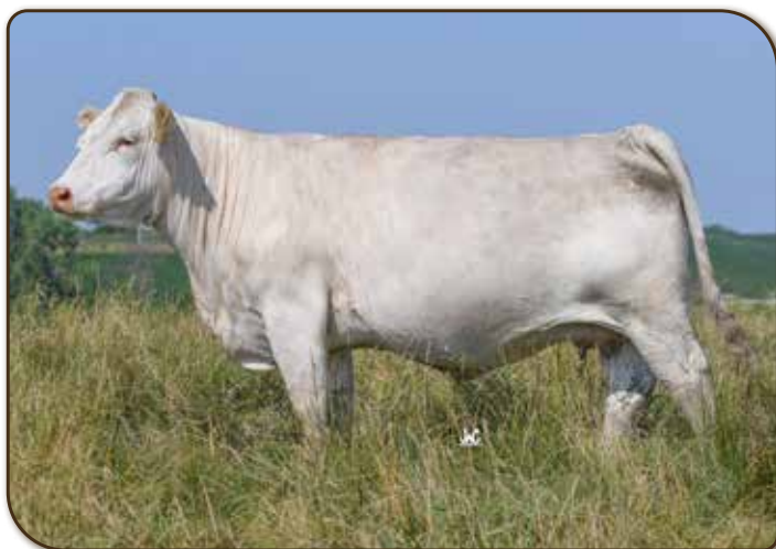
Lot 30 | Southern Delilah 45575