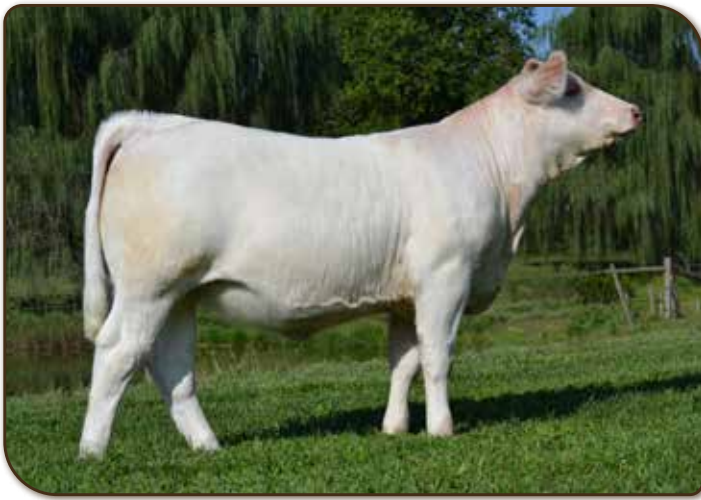
Lot 16 | DC Bravo's Nancy ET pictured as an Open Heifer