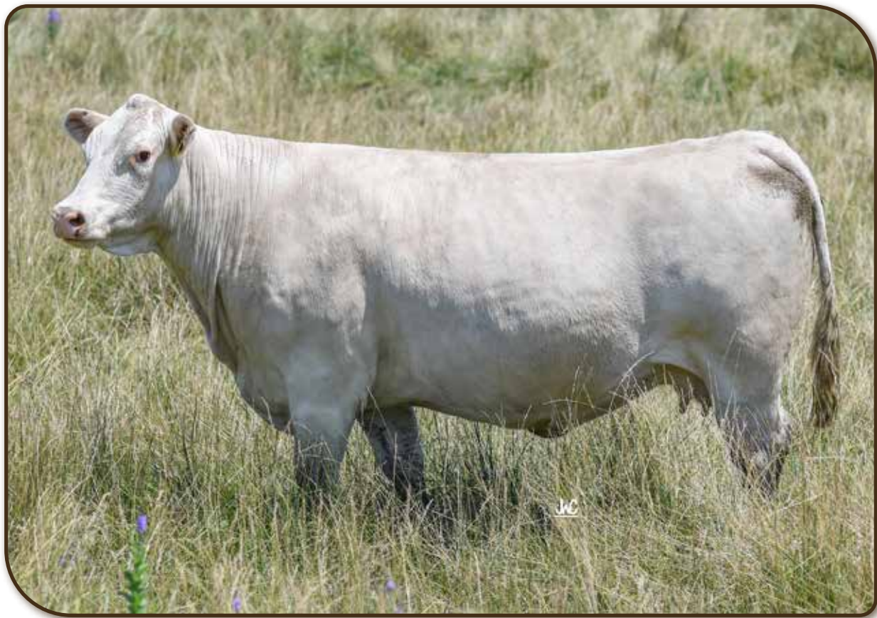
Lot 24 | SAS Ms Blue Bell 506P