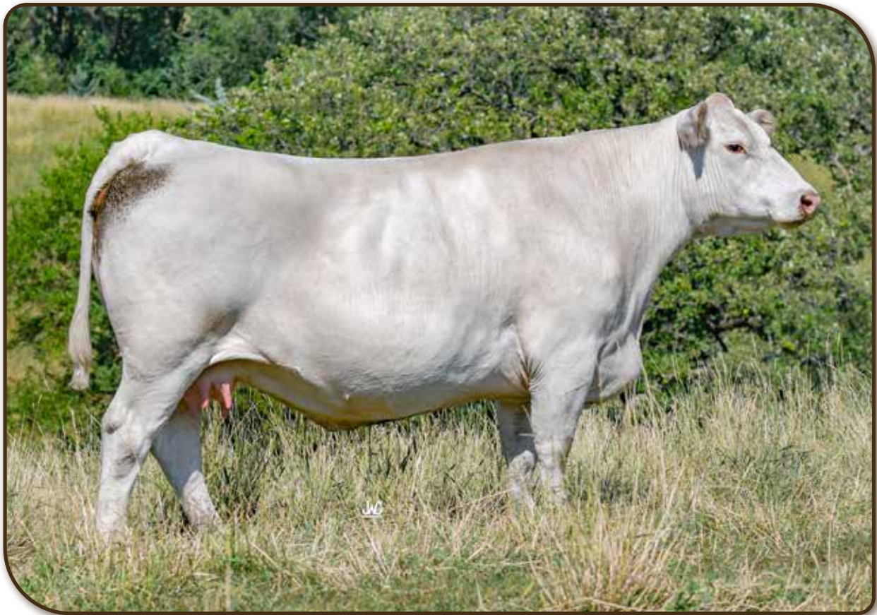
Lot 8 | SAS Ms Mamie Star Bell 501P