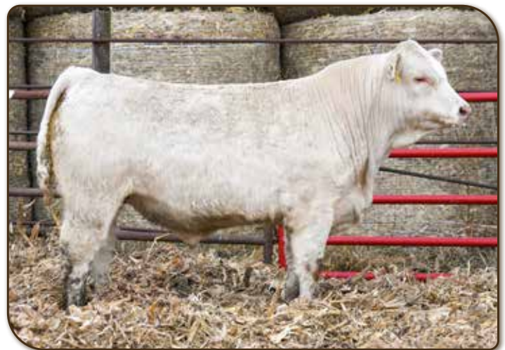
SAS Pendleton 9005 | AI Service Sire to numerous Spring Bred Heifers and Sire of several spring calves

ET bred heifer out of Milestone and Sara's 409 Donor selling as Lot 2. She's beautifully made and has all the right parts. She doubles up on J139 and Cigar for a more consistent pedigree and future calf crops.