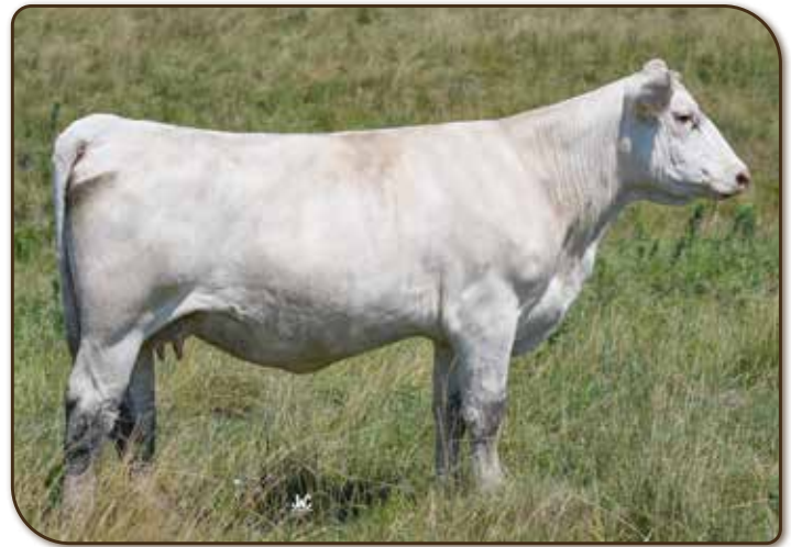
Lot 21 | SAS Ms Watt Cool Bells 906 P

These Watt Daughters are shaping up to be an impressive set of females and 906 is a perfect example. Sara calved the first group this past spring and they have great dispositions, mothering ability – beautiful udders with lots of milk, and outstanding feet and leg structure. All the first calf heifers were pasture exposed to her selection from the Wienk herd this spring – Tank son out of a Blackjack x Kingsbury first calf heifer.