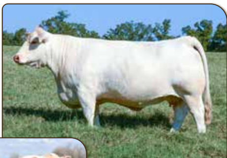
M6 Ms New Jewel 0155 Pld Dam of M6 Ms Sun Jewel 5124 P ET