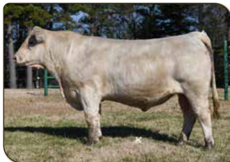
SAT Patriot 7228 P