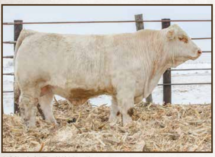
SAS Slamin Cadillac 8009 P | Lot 10

Top 3% WW. Top 7% YW. Top 10% Total Maternal. Top 15% TSI.