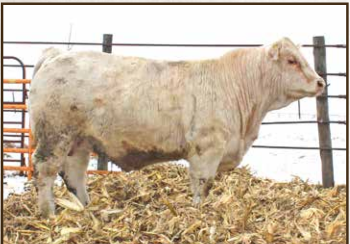
SAS Ledgers Choice 8006 P | Lot 4