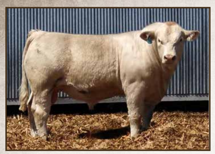
SAS Big Flirt 593A | Sire of Lots 7-9

Our senior walking herd sire. He adds frame combined with good feet and great temperament. Daughters so far seem to be excellent mothers and have good udders. His calves may be larger birth weight but they come unassisted with a smooth shoulder and lots of leg and length of body. No calving problems.