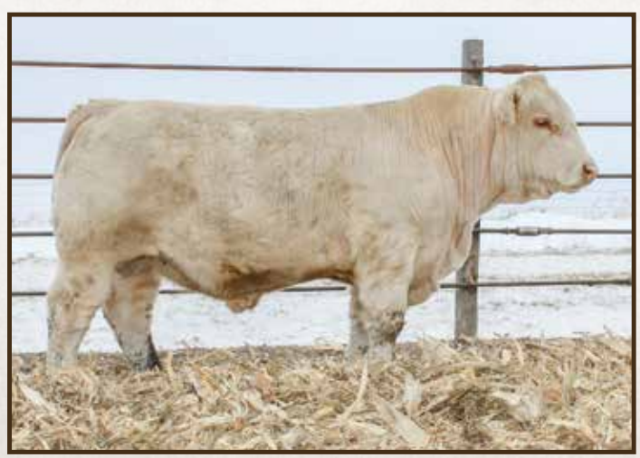
SAS Big Bravo 8005 P | Lot 8

A Big Flirt son out of a Ledger daughter. This is a combination of performance and calving ease in a moderate framed package. His dam raised our high selling open heifer in last year's sale.