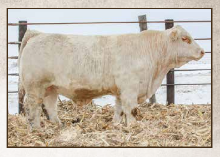
SAS Slamin Cadillac 8009 P AICA | M913061

Epds CE | 1.5 BW | 3.5 WW | 45 YW | 80 M | 16 MTL | 39 TSI | 219.11