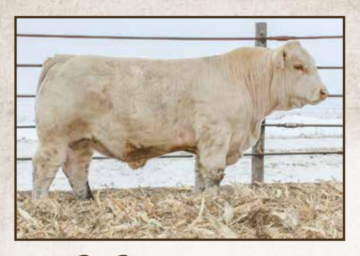
SAS Big Bravo 8005 P AICA | M913058

SELLING 22 BULLS INCLUDING FOUR 18-MONTH OLDS