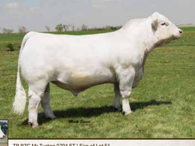
TR PZC Mr Turton 0794 ET | Sire of Lot 51

An ET bull that's fancy, moderate framed, thick made bull out of Turton, a well-known bull in the Charolais and club calf industries. His dam is our 14-year-old donor 5001 who is still in production. She was a featured donor at the Thomas Ranch sale.