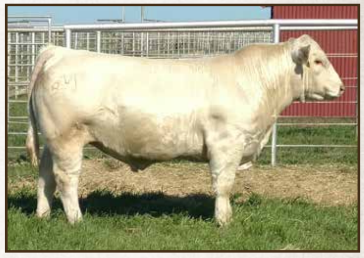
M6 Wrangler Yoda 4118 | Sire of Lots 3-7

Top 20% Marbling. Top 25% TSI and YW. Top 35% Calving Ease.