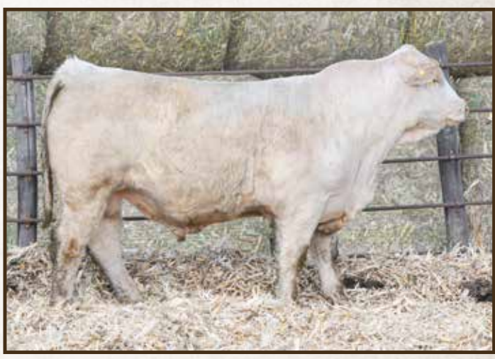
SAS Cool Doubt 2053 P | Lot 2

Epds 3.9 | 1.4 | 54 | 98 | 24 | 4.8 | 51 | 0.8 | 16 | 0.84 | 0.005 | 0.14 | 241.86