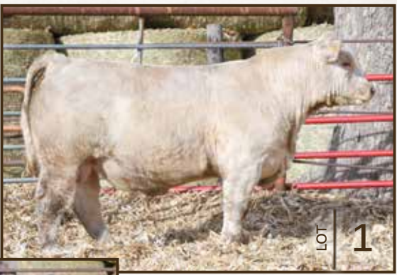
COOL REP x RE-BARA CIGAR 409 Performance DOB | 9/4/20 BW | 76 Epels BW | -0.4 WW | 60 YW | 105 M | 27 TSI | 246.01