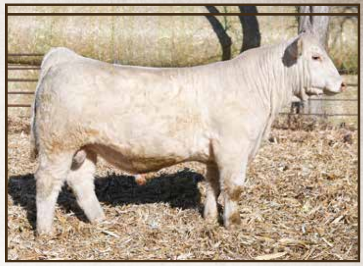
SAS Orient 2107 P | Lot 16

Long bodied and cool fronted this one will make you do a double take on sale day. He adds performance with a WW Ratio of 110 is a tie for first place with the natural born calves. Al sired from a favorite in the showring, for his females, and on the rail. His dam is a beautiful female with a heavy milking, gorgeous udder who is just starting to reach her prime. Top 2% Mtl; Top 3% Milk; Top 6% REA; Top 15% WW and Marb.