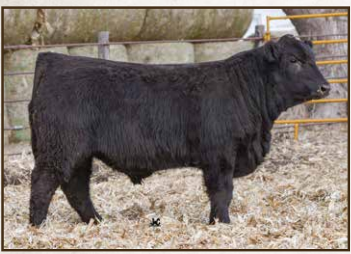
SAS Black Magic 2110 | Lot 34

Epds 7 0.9 56 115 26 44 0.64 0.59 0.02 51 2109 dam is a second calver whose calves are consistently low birthweight. Top 20% $M, $F, and $C