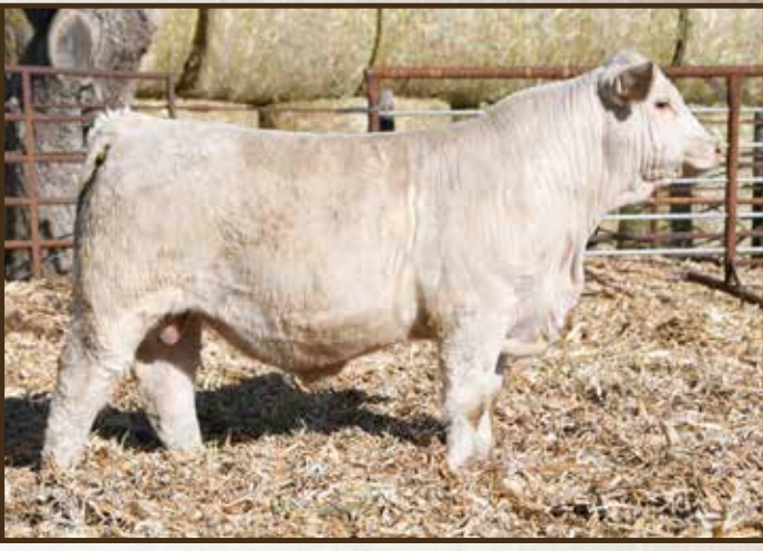
SAS Flirty Blend 2118 P | Lot 23

This one will catch your eye. His 11-year-old dam has done it again with another outstanding bull. This time out of our walking herd sire Big Flirt. Longevity, good feet, performance, and maternal traits round out this bull. He has really turned on the heat since weaning and continues to do so while boasting a 3.55 WPD. Check him out! Top 15% YW; Top 20% WW and CW; Top 30% TSI