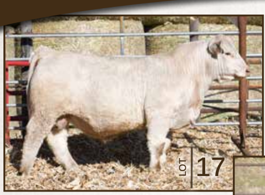
MILESTONE x WELLS-JBJ BREEZE 5001 Performance DOB | 1/21/21 BW | 84 Epcls BW | 1.6 WW | 52 YW | 96 M | 21 TSI | 239.02

OPEN HOUSE SATURDAY, FEBRUARY 26, 2022 Noon Lunch | Bid off 1 pm