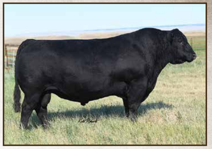
SydGen Enhance | Sire of Lots 35-40

SAS Enhance 2111 AAA | 20259146 DOB | 3/4/2021