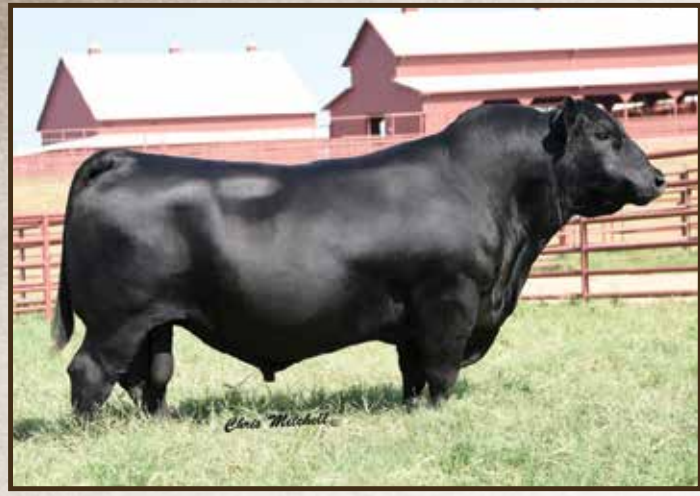
V A R Index 3282 | Grandsire of Lots 41-47