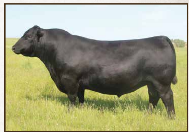
S A V Rainfall 6846 | Sire of Lots 30-31

2103 is out of a first calf heifer and calving ease AI sire SAV Rainfall. Moderate framed and low birthweight, he'd be great to use on heifers. Top 20% BW; Top 25% Milk