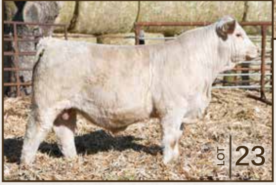
BIG FLIRT x EASY BLEND x GRID MAKER Performance DOB|3/4/21 BW|89 Epcla BW|3.0 WW|65 YW|114 M|14 TSI|249.06