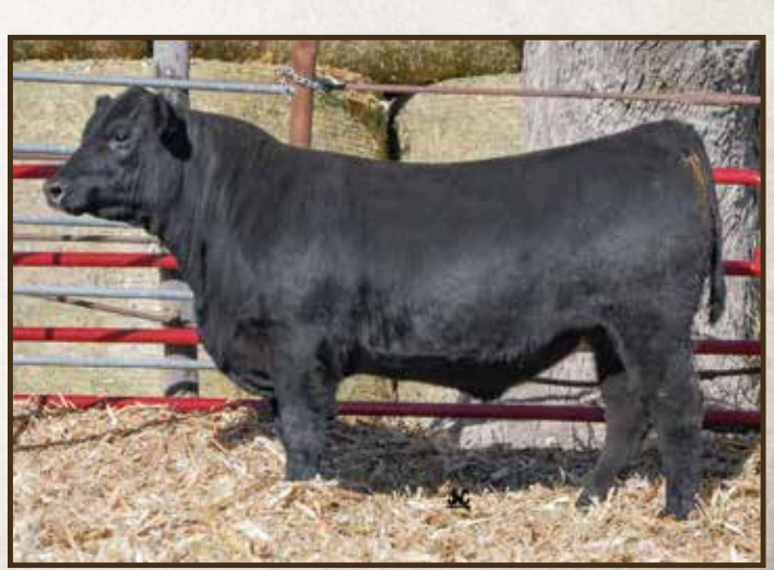
SAS Ozzie 2104 | Lot 32

Al sired calf out of Ozzie known for his maternal qualities along with calving ease and growth. Top 15% $M; Top 30% WW