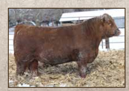
YCRA Poreigner H90 FOREIGNER E127 X YARDMASTER X PREMIER Epds BW|-5.4 WW|58 YW|90 M|23 ProS|67 USED ON HEIFERS.