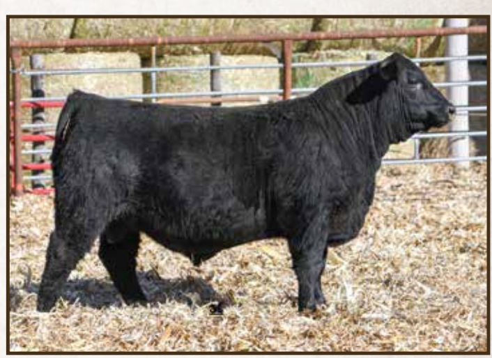
SAS Enhance 2111 | Lot 38

Take a special look at this bull. Al sired out of an 12-year-old dam that has done it over and over again. She's a Pathfinder dam so it shouldn't surprise you that she has raised 10 calves with an average weaning weight ratio of 107 and yearling weight ratio of 105 and birthweights below normal. She has done it again with the heaviest weaning weight ratio bull of the group at an awesome 823 lbs! Top 10% $M and $G; Top 15% Marb, Fat, $W and $C; Top 20% WW and Milk; Top 30% $B