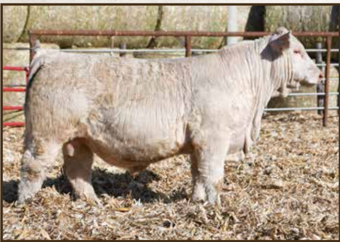
SAS Adair 2110 | Lot 15

Flirty Whiskey 2109 is out of a home-raised herd sire that is working in a purebred herd in TX. His dam is out of second calver also out of our walking herd sire, SAS Big Flirt. He is similar in like and kind with a similar performance pedigree to Lot 13. Top 6% REA; Top 15% YW and CW; Top 20% CE and TSI; Top 25% WW and MCE; Top 30% Mtl