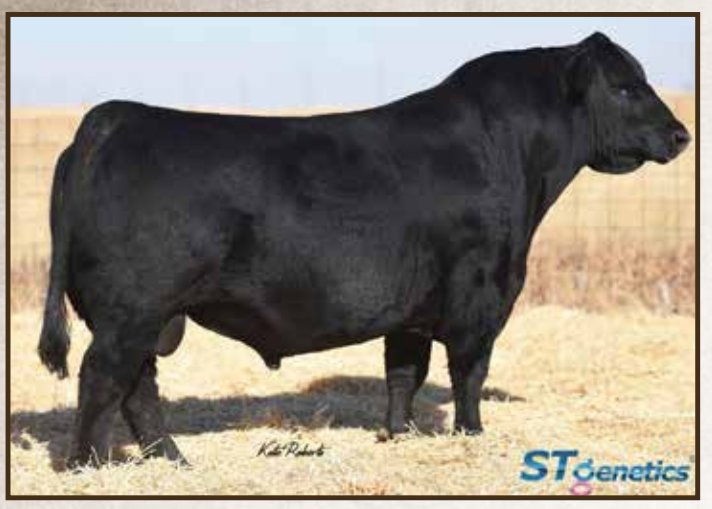
Ox Bow Ozzie 3233 | Sire of Lots 32-33