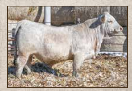
SAS Virtual Happy Hour 9051 AFFINITY X M6 COOL BACHELOR X RIO BRAVO Epds BW|-5.2 WW|60 YW|99 M|31 TSI|246.11 USED ON HEIFERS.