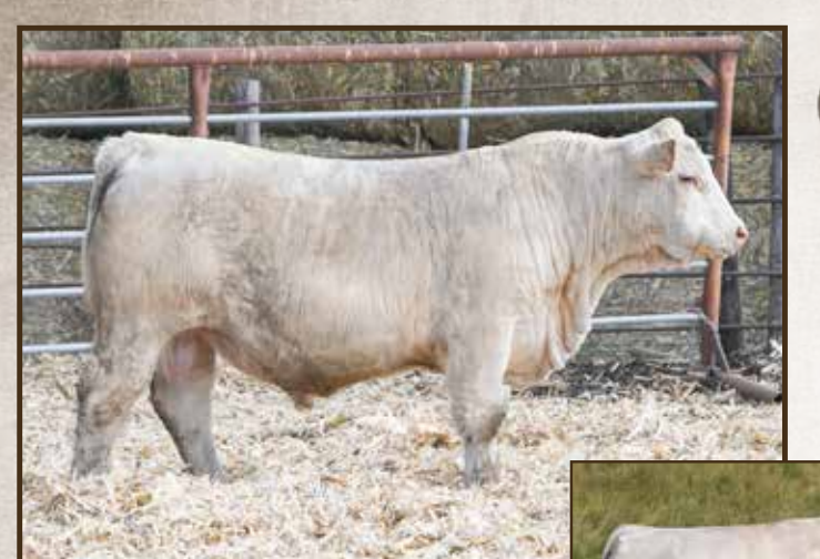
SAS Bell Standard 2059 P ET | Lot 4