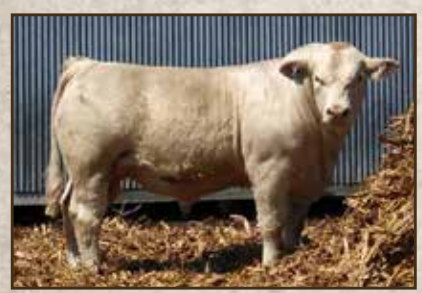
SAS Big Plirt 593A CJC BIG SKY X RIO BLANCO X FLIRTINFORCERTIN Epds BW|6.8 WW|69 YW|125 M|14 TSI|257.78 SENIOR HERD SIRE. SONS SELL!

OPEN HOUSE & SALE KICK-OFF SATURDAY, FEBRUARY 26, 2022 NOON | COMPLIMENTARY LUNCH 1:00 PM | BID-OFF