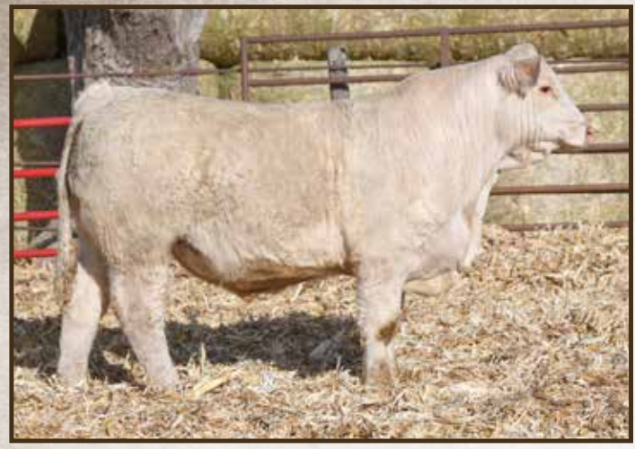
SAS Fontanelle 140 P | Lot 27

SAS Watt Ringin Bells 2121 P DOB | 3/7/2021 AICA | M961990 POLLED