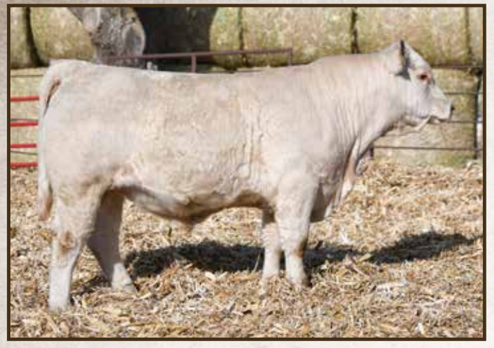
SAS New Mister 2106 P | Lot 20

SAS New Mister 2106 P DOB | 2/11/2021 POLLED