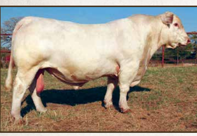
M6 New Standard 842 PET | Sire of Lots 4, 20-21

The next two lots are out of a M6 New Standard, a multiple trait leader whose sons and daughters are still in demand. 9150, the dam of New Mister, is 12-years-old and due any day with another Al calf. As you can see, she continues to do an excellent job with a beautiful udder, great feet, and an easy keeper out of another breed legend LT Bluegrass. Top 2% SC; Top 4% Marb; Top 25% TSI; Top 30% YW