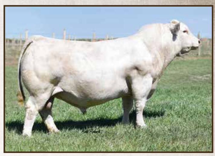
LT Affinity 6221 Pld | Sire of Lots 6-8

A 3/4 brother to Lot 7, here is another heifer safe bull in the offering. He also offers the highest performance of the Affinity sons and lots of maternal power from all sides of his pedigree. Top 15% Marb; Top 20% BW and Milk; Top 25% CE; Top 30% Mtl