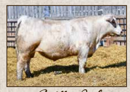
WCR Cadillac Pack 074 TANK X ELDER'S BLACKJACK X KINGSBURY Epds BW | 0.1 WW | 77 YW | 149 M | 28 TSI | 289.73 NEW ADDITION IN 2021!