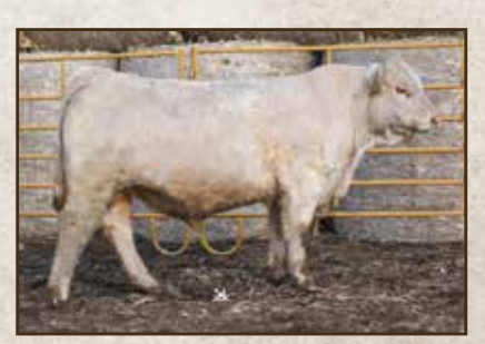
M&M Watt 6564 ET BJCF WATT X BLUE VALUE X DUKE 914 Epds BW|2.6 WW|68 YW|115 M|26 TSI|252.63 SENIOR HERD SIRE. SONS SELL!