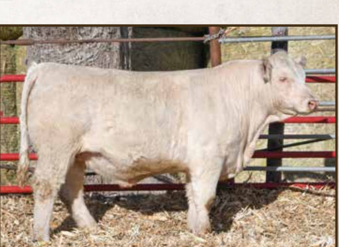
SAS Canby 2111 P | Lot 10

This is the first bull from our SAS Cool Ledger 8010 sire group. He has the highest birthweight to weaning weight spread and 3rd highest weaning weight of the offering. If you're looking for calving ease, performance, style, and an EPD profile to match take a look at this one. Top 6% WW; Top 8% YW; Top 10% SC; Top 15% Mtl, TSI, and REA; Top 25% CE; Top 30% BW, MCE, and CW