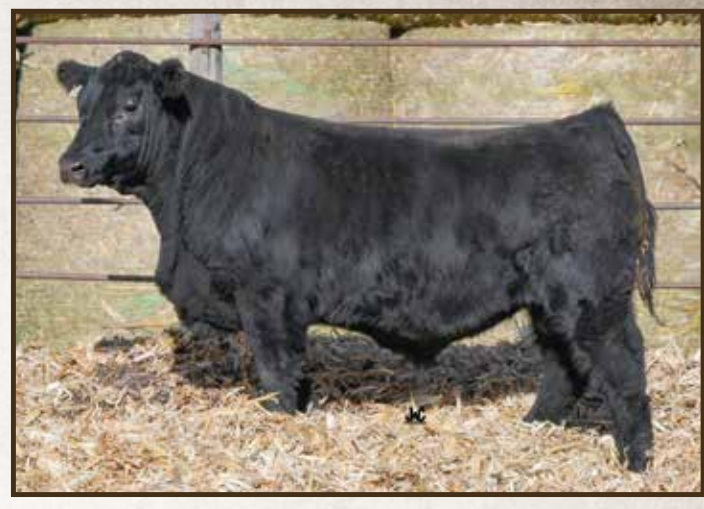
SAS Rainfall 2101 | Lot 30

27 1.1 56 A standout bull out of a first calf heifer and Al calving ease sire SAV Rainfall. He packs muscle, thickness, and depth of body in a stylish package.