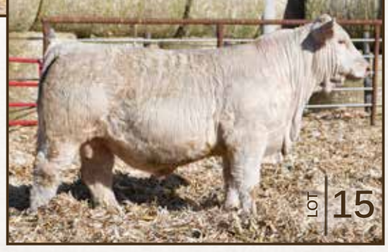
PATRIOT x M6 COOL REP x M&M STEALTH 8512 Performance DOB | 2/18/21 BW | 96 Epds BW | 0.9 WW | 65 YW | 113 M | 28 TSI | 249.57

Performance DOB | 2/23/21 BW | 75 Epds BW | 1.1 WW | 56 M | 27