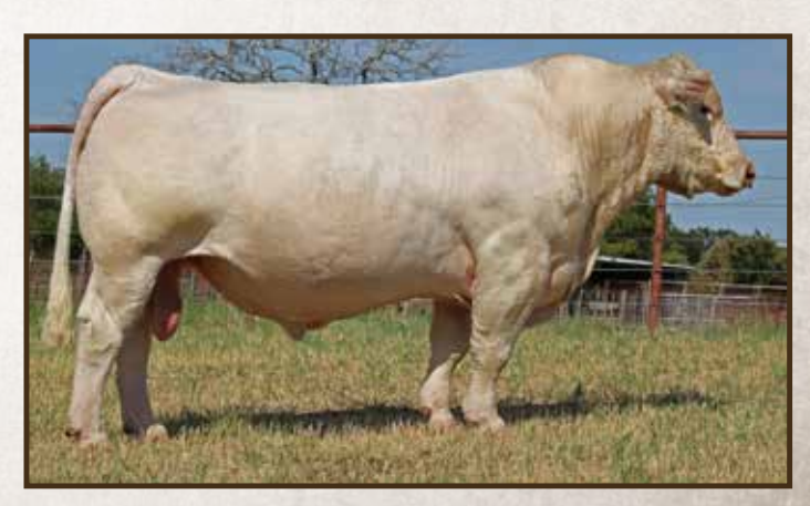
M6 Cool Rep 8108 ET | Sire of Lots 1-3

The third age-advantaged Cool Rep son in the offering. His dam has been a consistent producer who is now working in a purebred herd in NY state. He shares the look and performance of his half-brothers. Top 4% REA; Top 10% Fat; Top 25% Milk; Top 30% Mtl