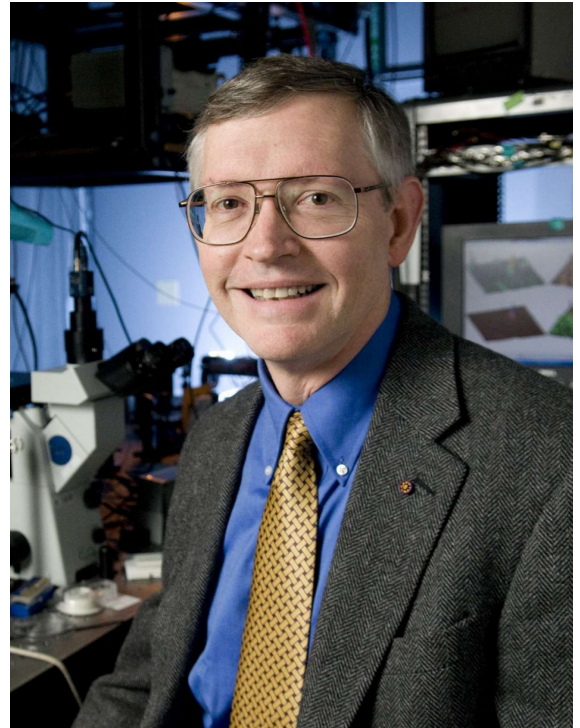
Stanford University Professor William Moerner is a Nobel Prize winner and graduate of Thomas Jefferson High School.

William Moerner: Moerner, a 1971 Jefferson graduate, is one of three scientists who won the Nobel Prize in 2014. The Stanford University professor earned the honor for “using fluorescence to extend the limits of the light microscope,” which has made it possible to study molecular processes in real time.