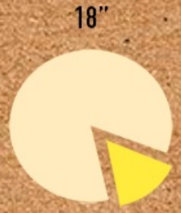
18" FAMILY 16 SLICES