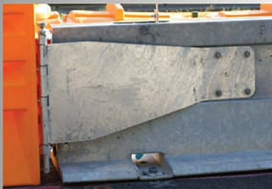
Steel Barrier Attachment