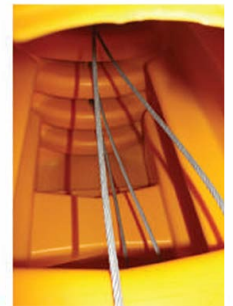
SLED™ Internal Cables