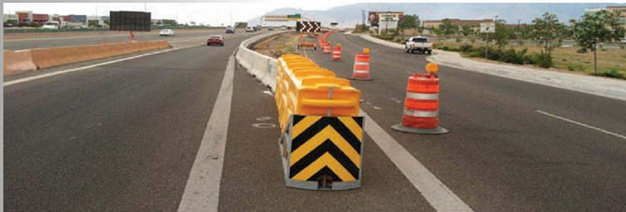
SLED™ TL-3 in New Mexico