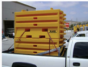
SLED™ TL-3 Transports in a Pick-Up Truck