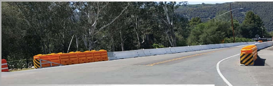
SLED™ TL-3 in use on a San Diego Roadway