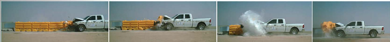
SLED™ TL-3 4900 lb. Pick-Up Truck Impact Attached to Concrete Median Barrier Wall

* Steel and plastic NCHRP 350 approved only.