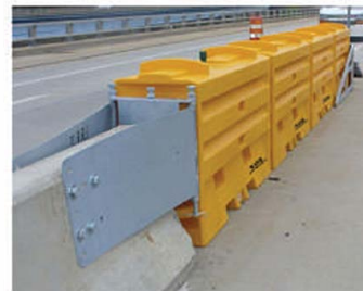
Concrete Barrier Attachment