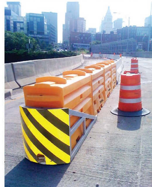
SLED™ TL-3 in Downtown Cincinnati, Ohio