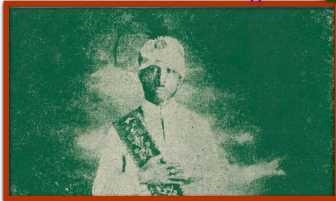
Noble Drew Ali , Founder of The Moorish Science Temple of America