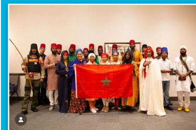
Annual group picture with members from all temples