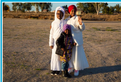
Beautiful young members representing the Moorish Youth