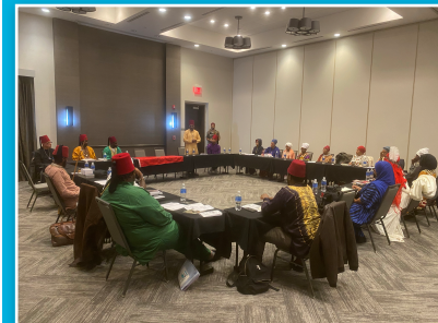
Members actively involved in the affairs of men

In reflection, the weekend at Allensworth National Park served not only as a commemoration of shared heritage but also as a source of inspiration for the ongoing work within local temples. The bonds of affection forged during this gathering will undoubtedly contribute to the continued growth and prosperity of our Moorish community. Islam