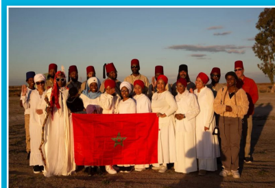
Allensworth National Park Honoring our Moorish American Flag