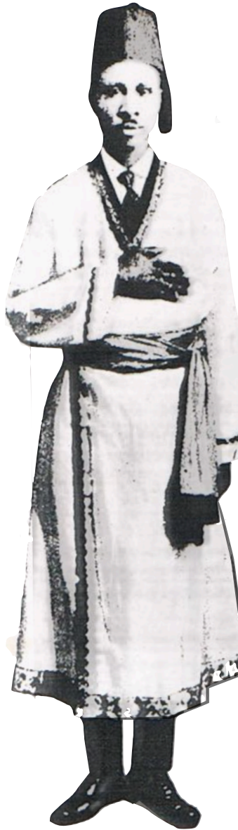
Noble Drew Ali Founder

Act 5. —This organization of the Moorish Science Temple of America is not to cause any confusion or to overthrow the laws and constitution of the said government but to obey hereby.