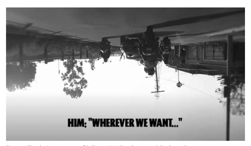
Figure 6. The closing sequence of Belhaven Meridian.

sonic and visual spaces.<sup>72</sup> Eshun's aesthetical "discontinuum" concept thus encapsulates a "digital diaspora" of humans through "computerhythms, machine mythology and conceptechnics . . . connecting the UK to the United States, the Caribbean to Europe to Africa."<sup>73</sup> Rejecting articulations of a digitised, networked utopia which accounts for and simplistically unites all forms of Afrodiasporic cultures in harmony, the "discontinuum" signifies that there are no aesthetic requirements or universalising logics underpinning Afrodiasporic art, save for the stipulations that the artist descends from this particular geographical area, and that digital technologies feature