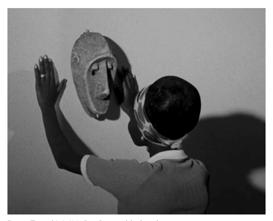
Figure 4. The mask in La Noire De . . .