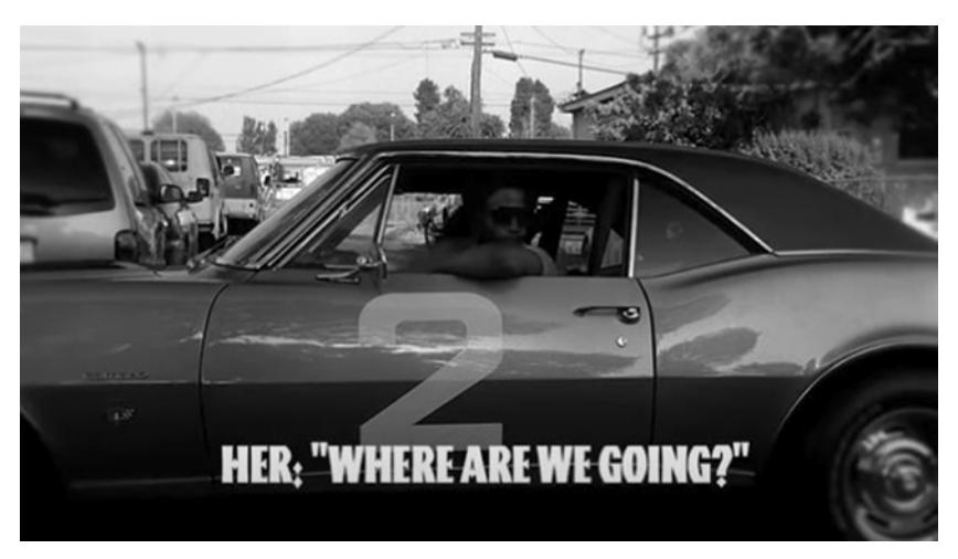
Figure 5. The opening sequence of Belhaven Meridian . Screen grab by the author.