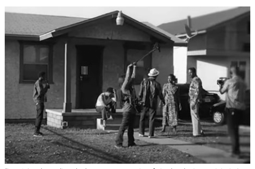
Figure 2. Joseph remediates the doorstep scene, capturing a fictional production crew in 'action'.