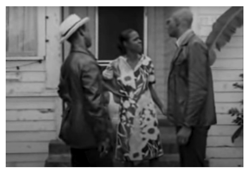
Figure 1. Stan's wife confronts the gangsters.