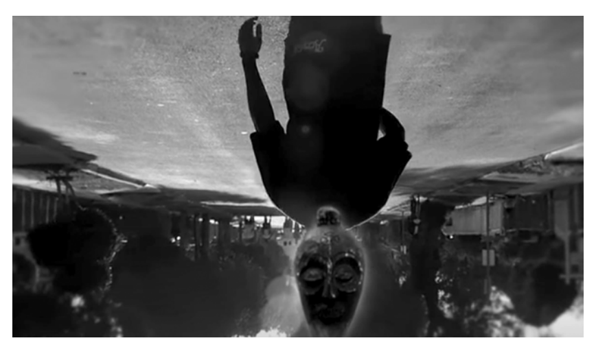
Figure 3. The mask in Belhaven Meridian .