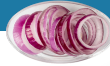
Onion (Slices or pieces)