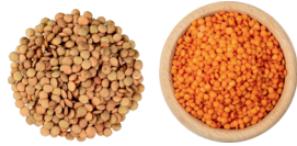
Bown and Yellow Lentils