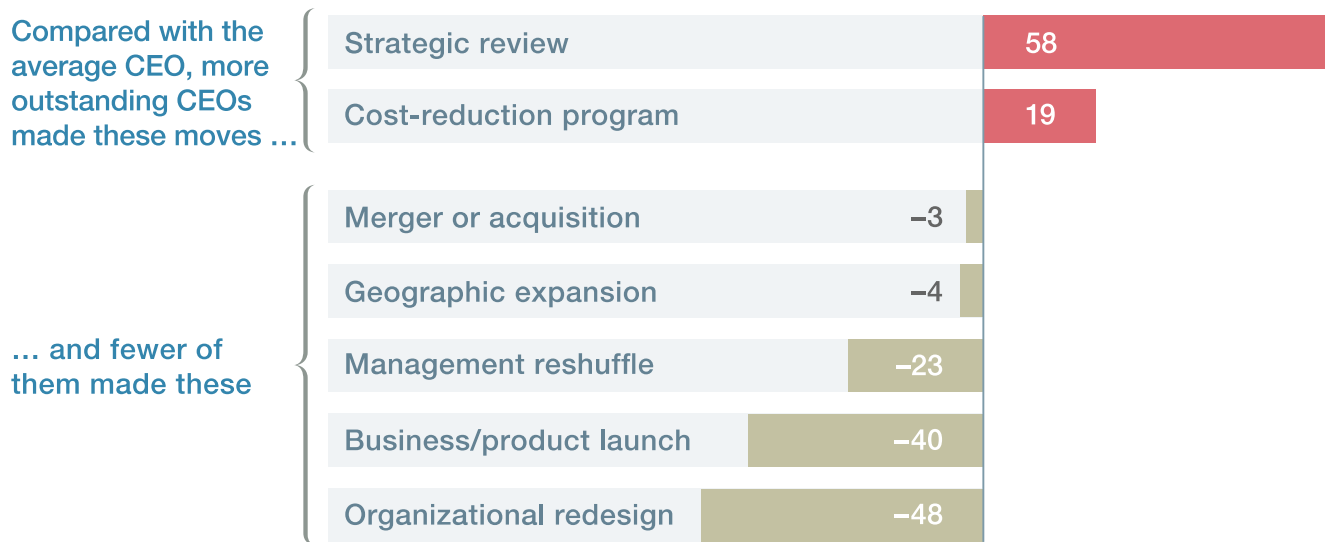
Strategic moves taken in first 2 years of tenure, share of exceptional CEOs vs all CEOs, %