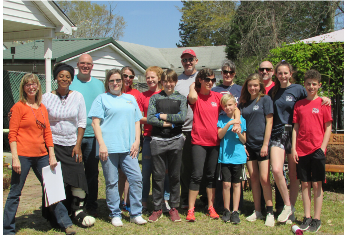
A Home Group from Cedar Creek Church recently volunteered at our ministry.