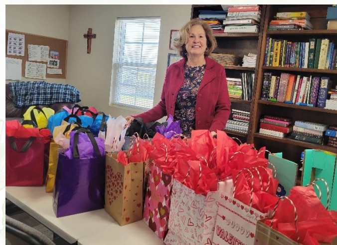
Valentine's Day gifts from the Palmetto Sertoma Club for the ladies and children at SATCM