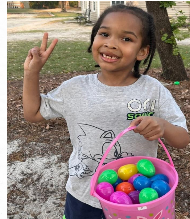
Easter fun at SATCM 2026