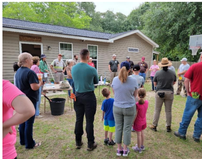
Calvary Chapel Work Day & Fun Day