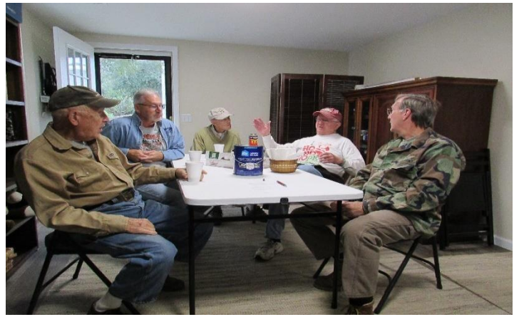
Some of Thursday crew discussing work plans