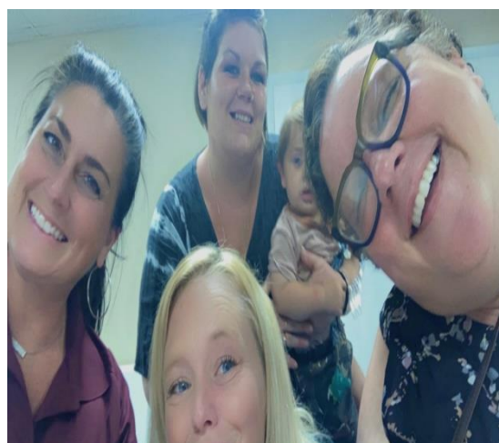
Building good friendships