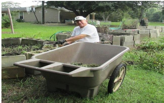
The Mustard Seed Garden Team working on our garden