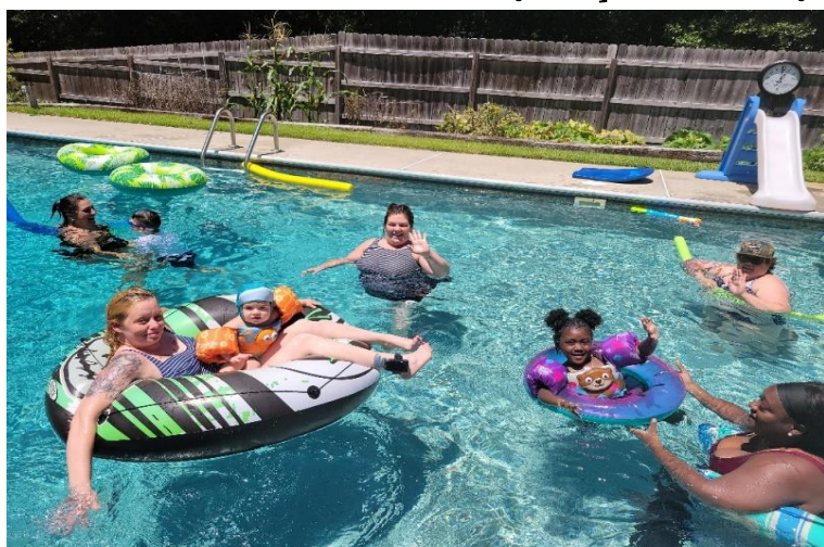
Residents enjoying swimming Together