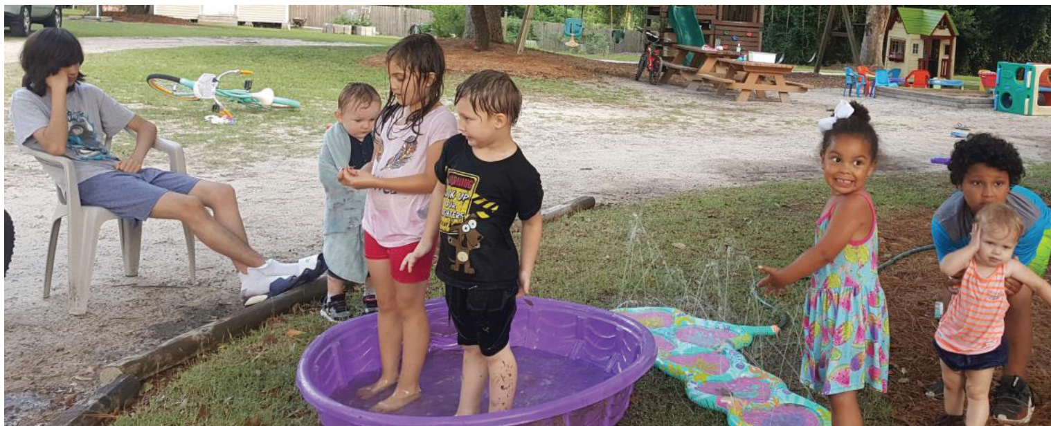
Kids had summer fun on the playground