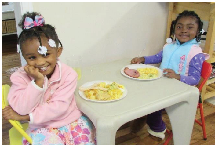
Thanksgiving meal with new friends at SATCM