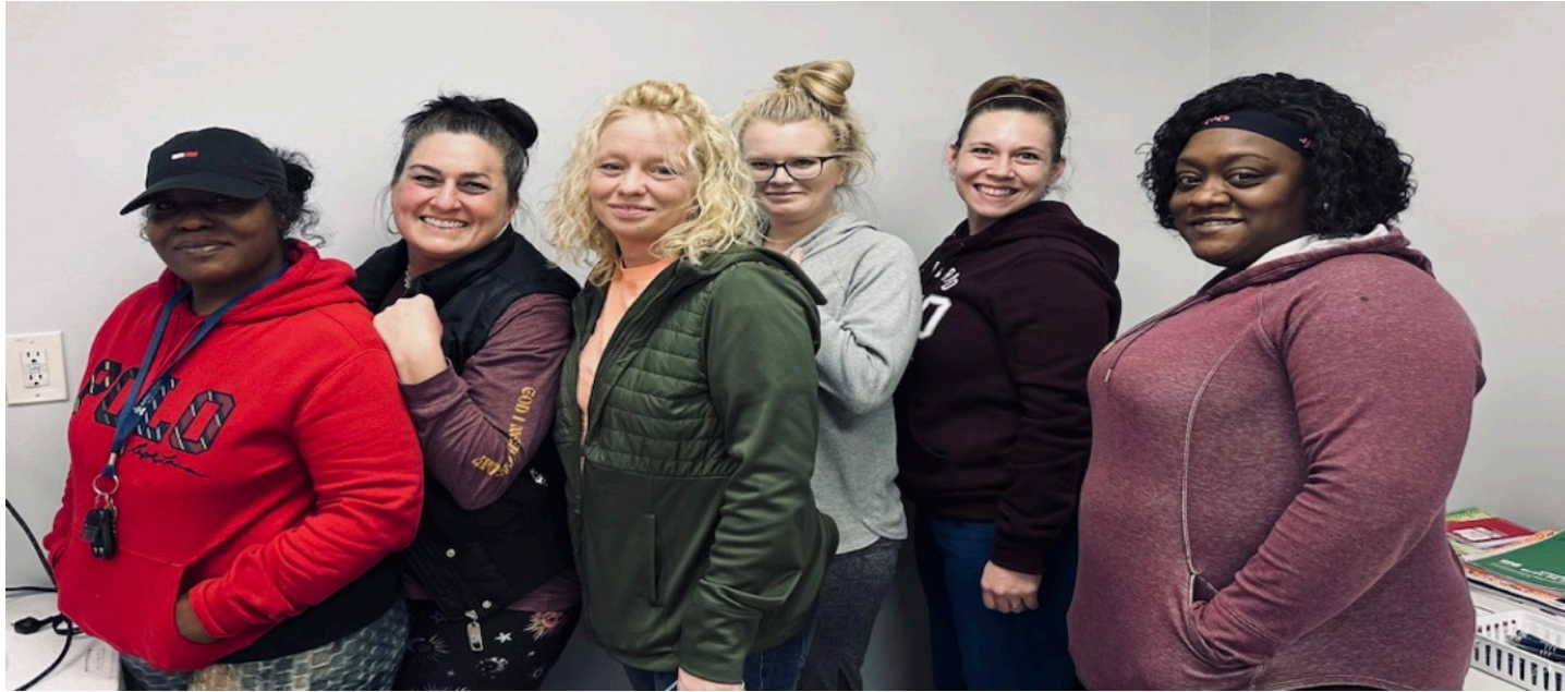
Some of our ladies after a Wednesday night Bible Study