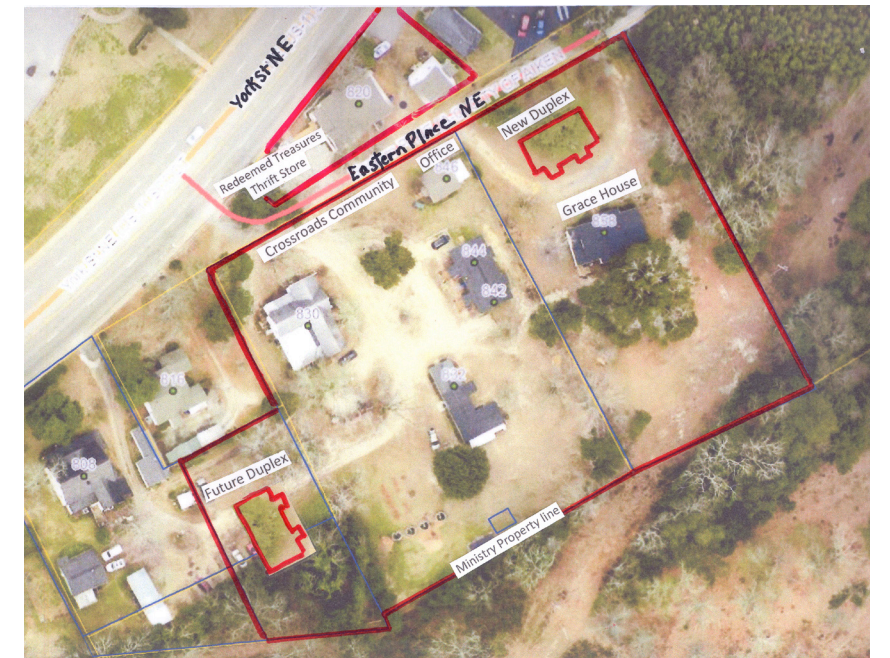
Building Plans for the New Duplex