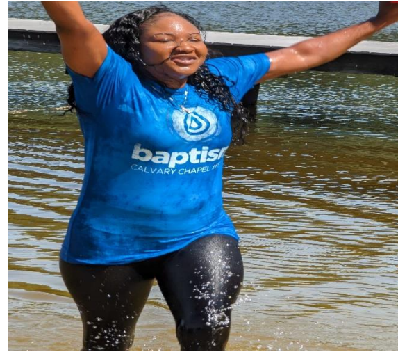
Baptism, celebrating new birth in Christ