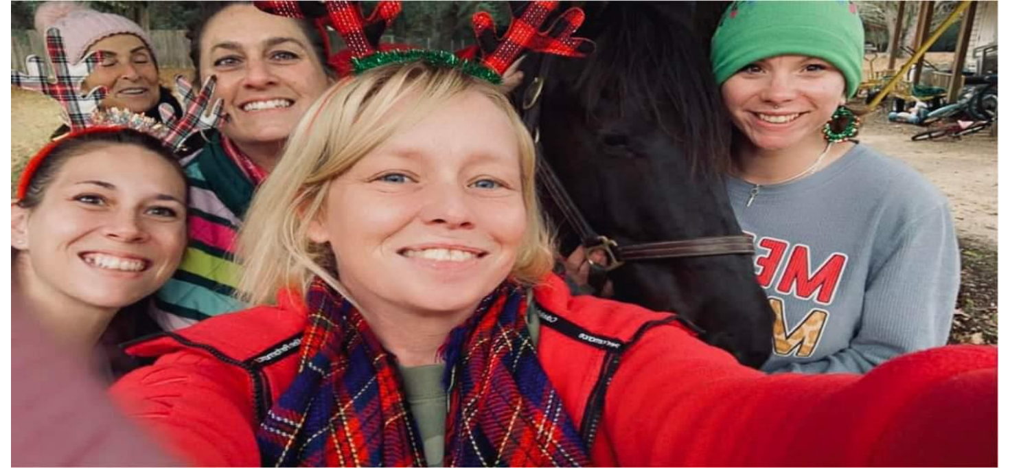
The ladies love Christmas celebrations. They are so thankful for the donations of Christmas gifts, and gift bags and gift cards they receive from churches & individuals in the community.