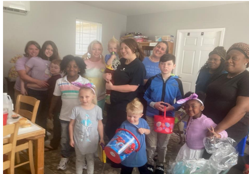
Making new friends