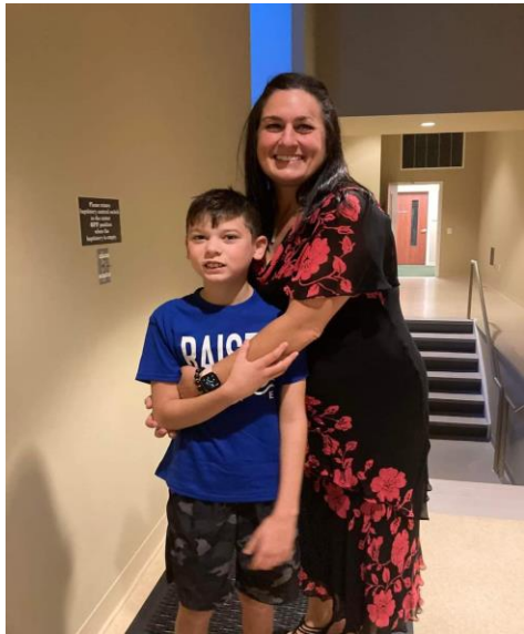
Getting custody of a son