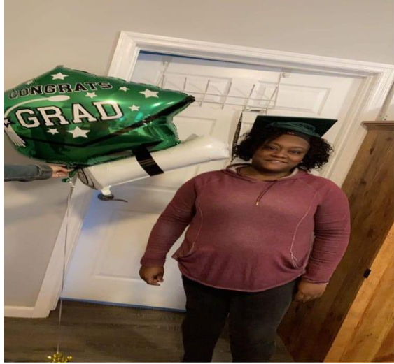
Graduation from GED classes