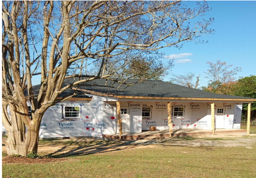
Our new duplex build: Next step is siding outside and sheet rock inside

Thanks to Lighthouse Baptist Church, &Calvary Chapel, who provided Christmas presents for ladies & children at SATCM.