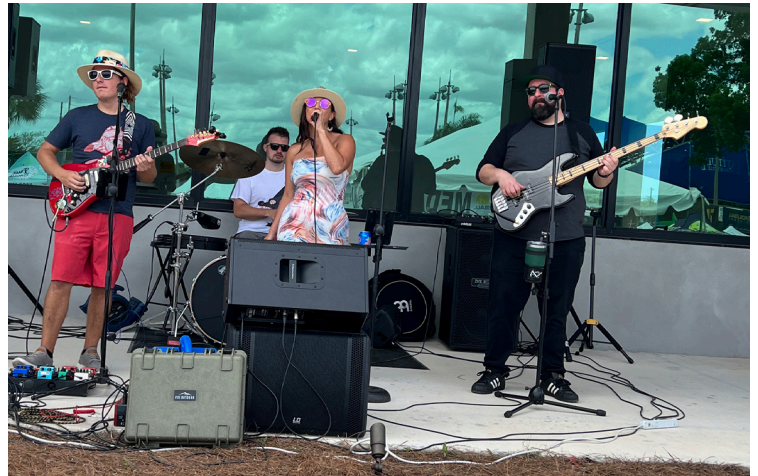
The Moonstone Riders performed in front of the new Welcome Center on Saturday.

Please check out today's Draws/Match times at: www.USOpenPickleball.info > What to Know