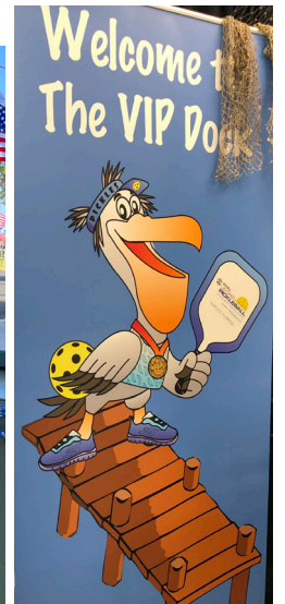
Pickles the Pelican