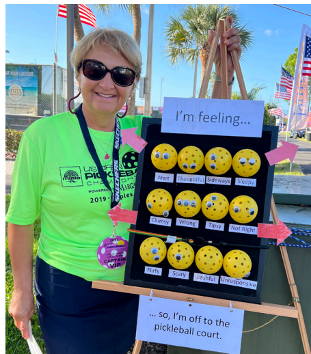
How you feelin'

Zing Zang Championship Court Access... Tickets are required for entrance to the Zing Zang Championship court on all days of competition. Limited tickets may be available, check with Ticket Desk in Park. Remember, all 59 other courts are free to watch!