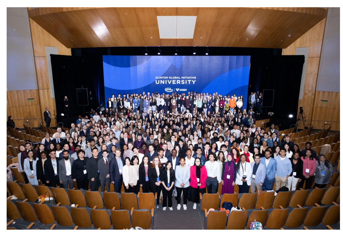
CGI U 2023 Class