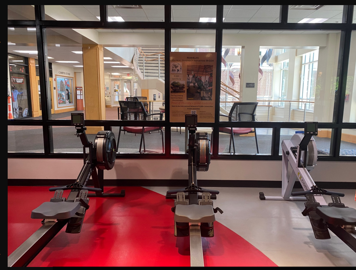
R-GDI at Drysdale Student Center; University of Lynchburg