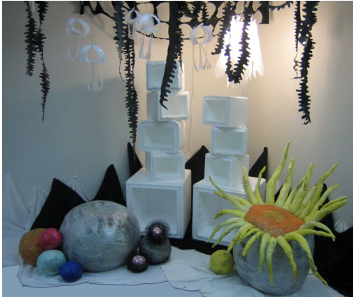
Plastic Seats (Seat Anemone and Seat Foam)