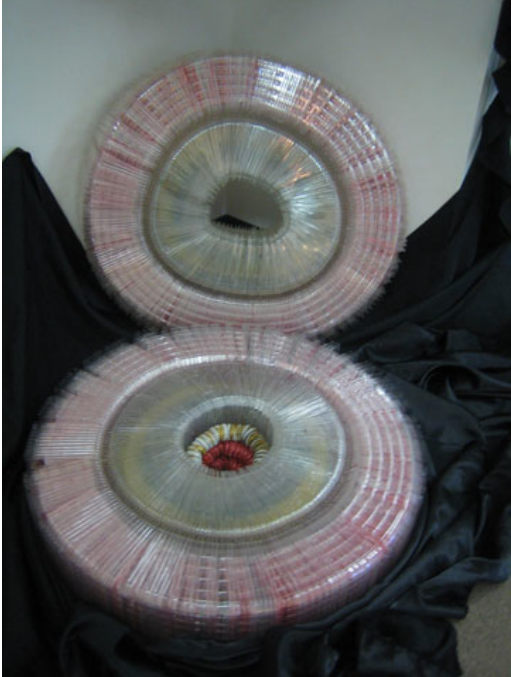
Discarded berry containers