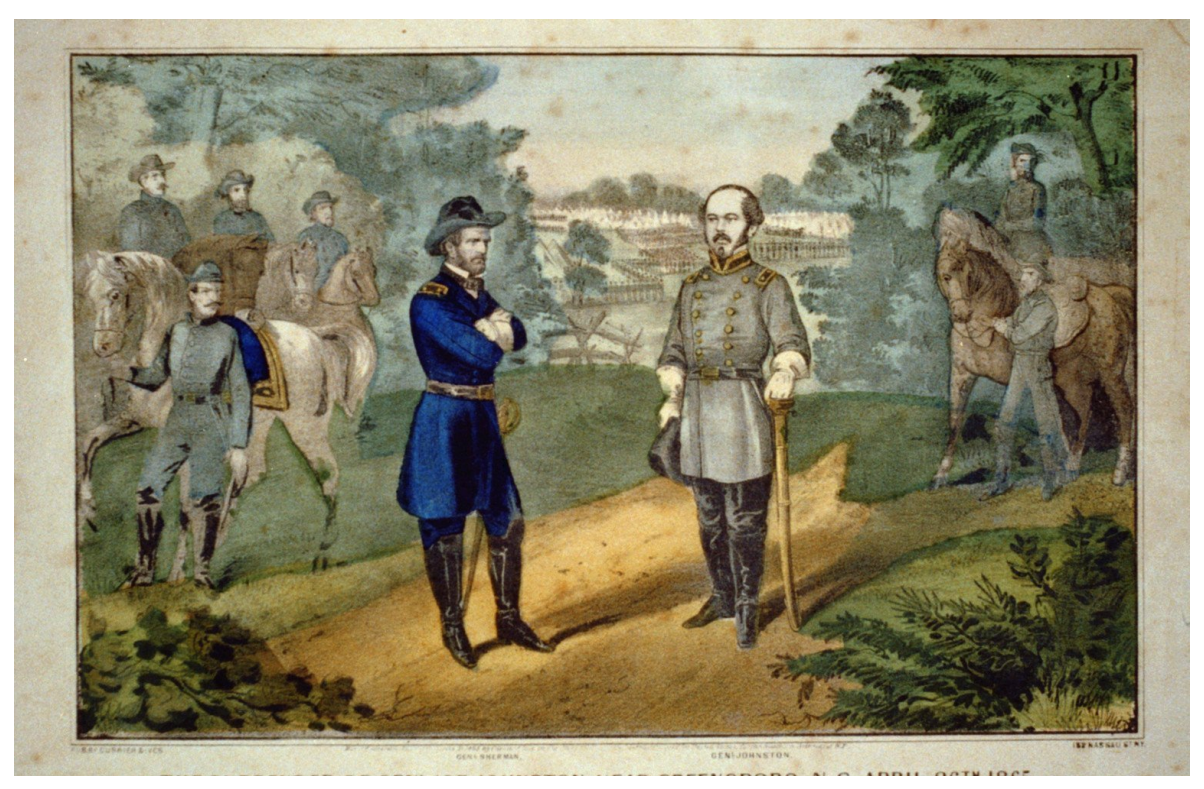
"The Surrender of General Joe Johnston" [date and location cropped out in deference of the trivia question, above]