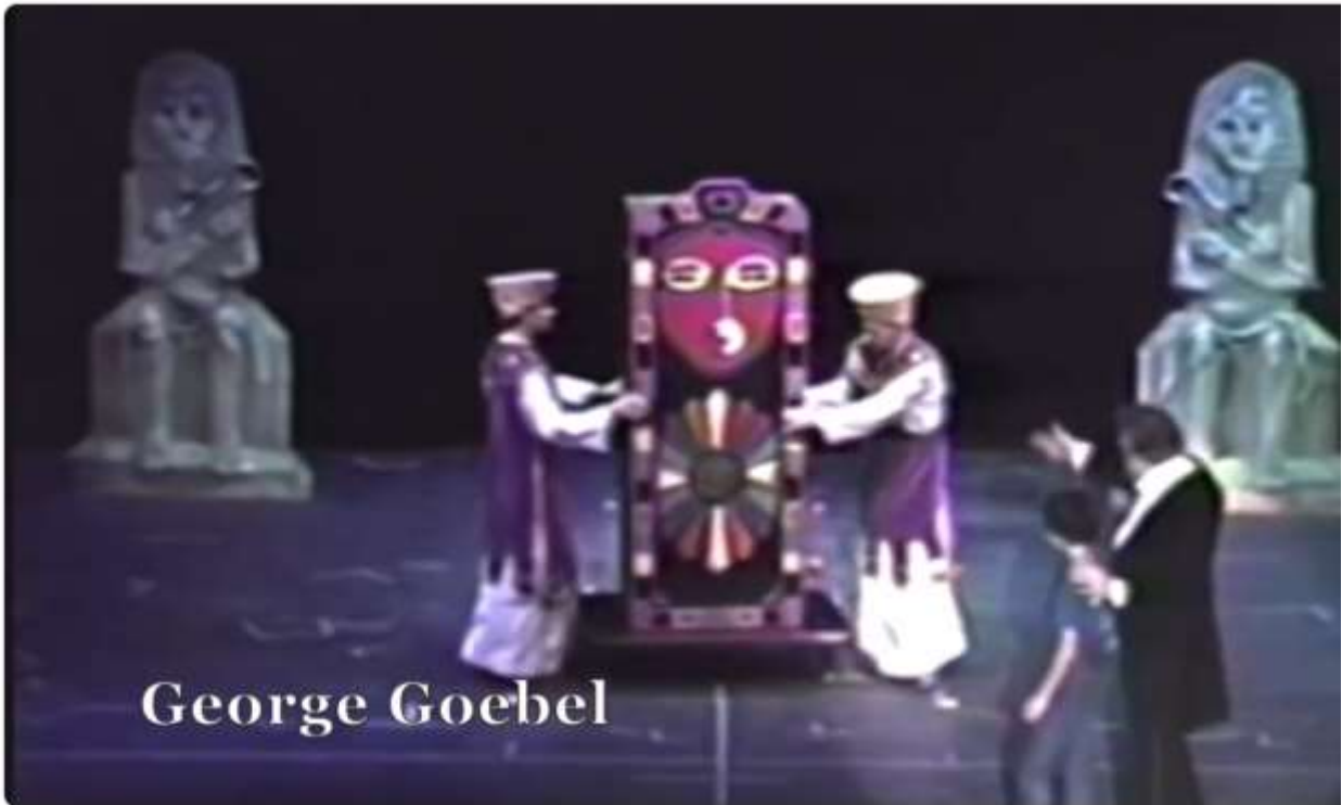
A Visit to Baffling Bill's Illusionarium