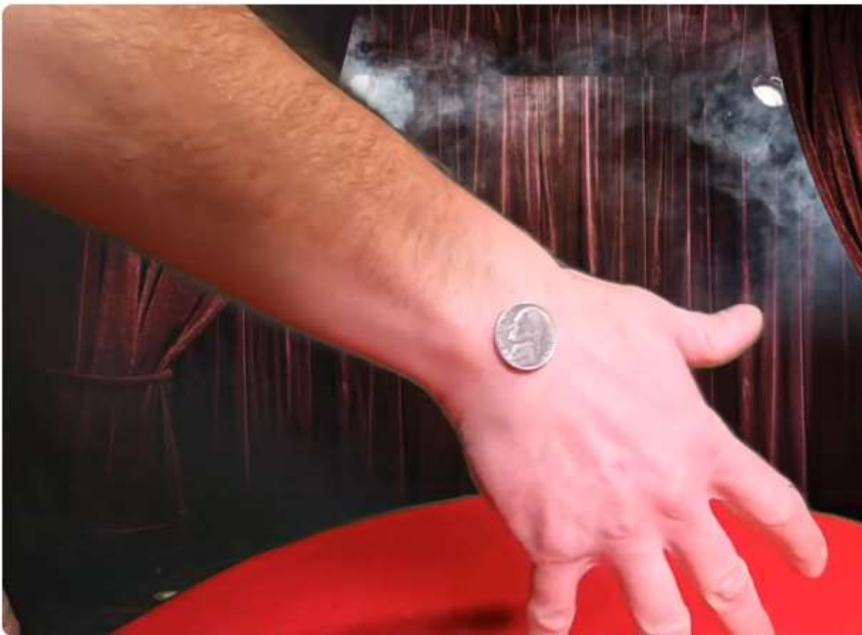
Dad Magic and the Vanishing Nickel