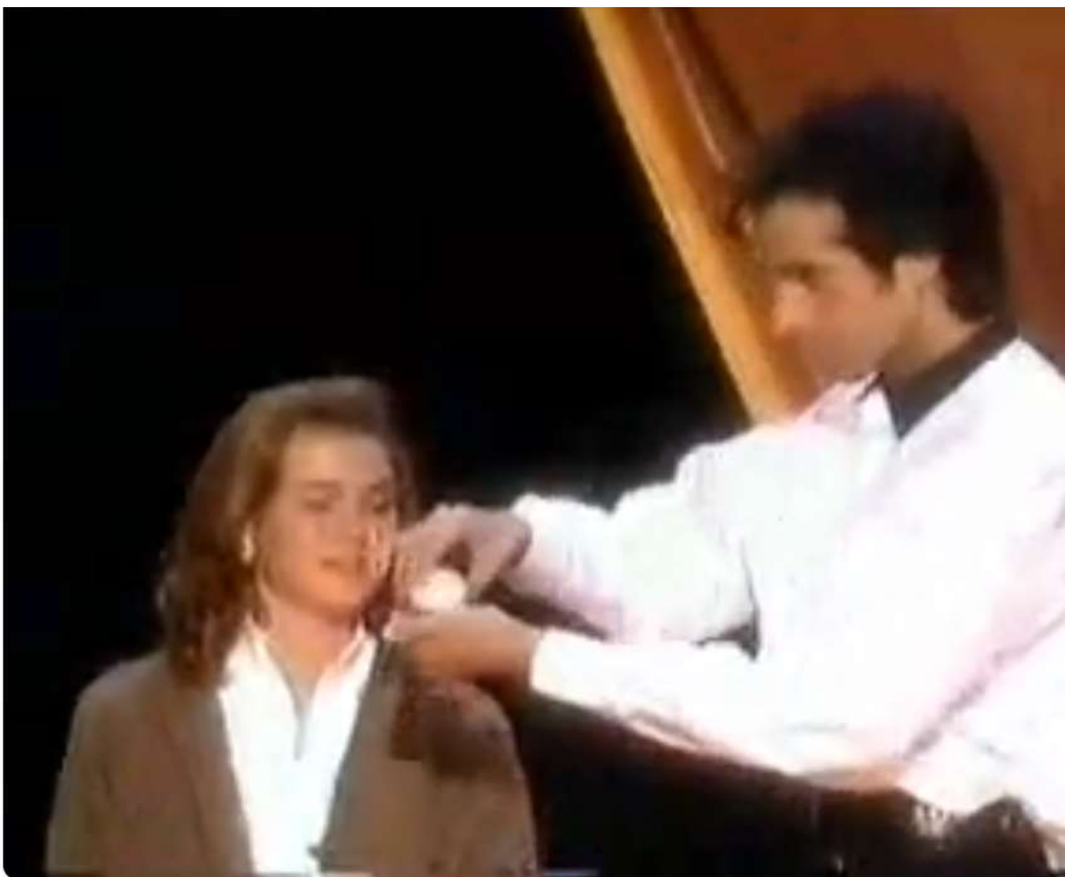
David Copperfield The Vanishing Egg in English