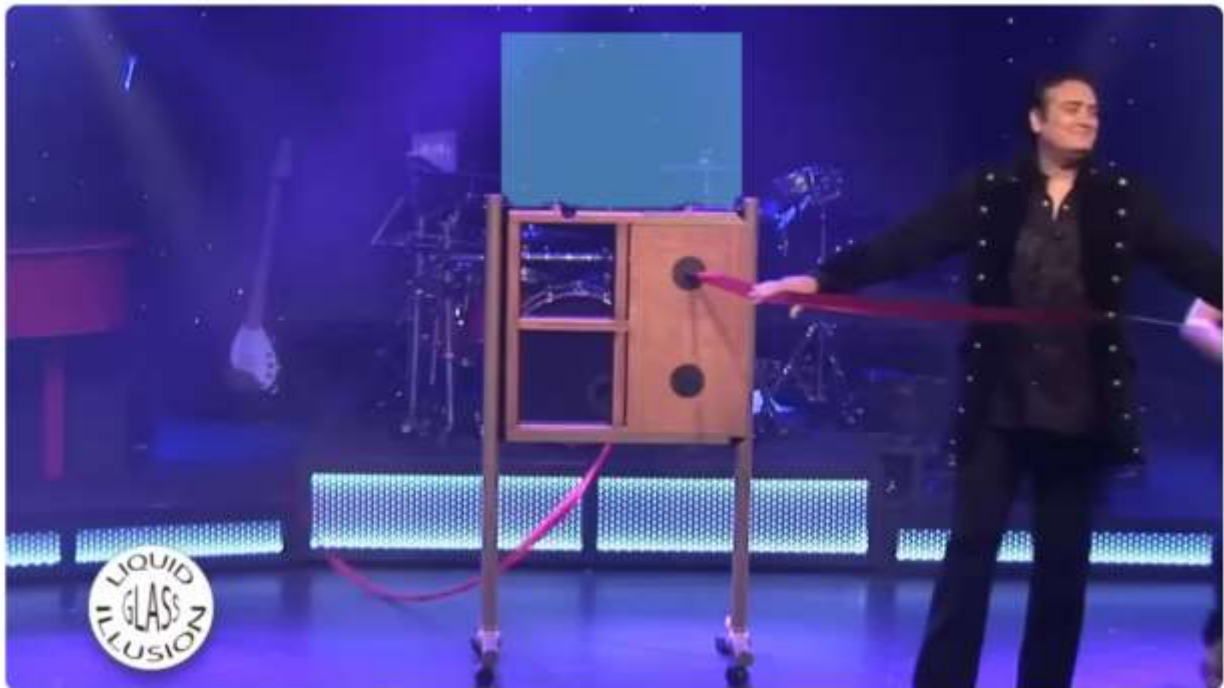
Liquid Glass Illusion Magic Secret Revealed | ACE

https://www.youtube.com/watch?v=1Qe6_RugyfE