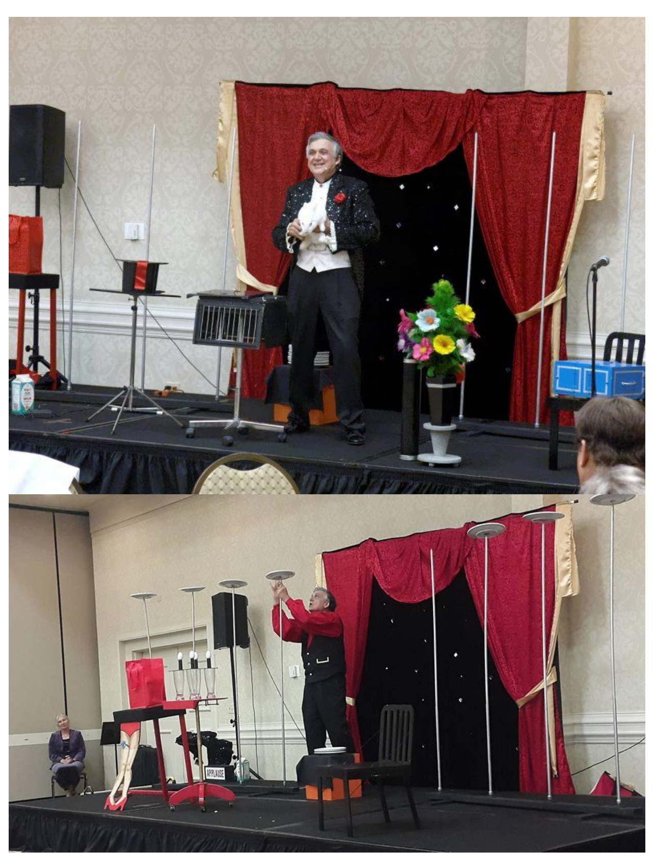
This entry was posted in \underline{\text{Monthly Newsletter}}. Bookmark the \underline{\text{permalink}}. \underline{\text{Edit}}