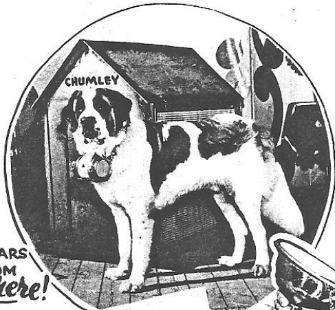
APPEARS FROM Nowhere!