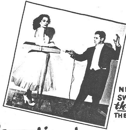
NEON SWORD through THE LADY