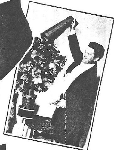
FLOWERS FROM Allah's GARDEN