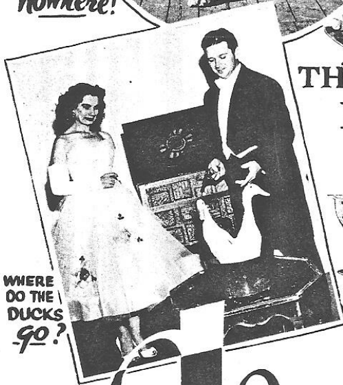
WHERE DO THE DUCKS go?