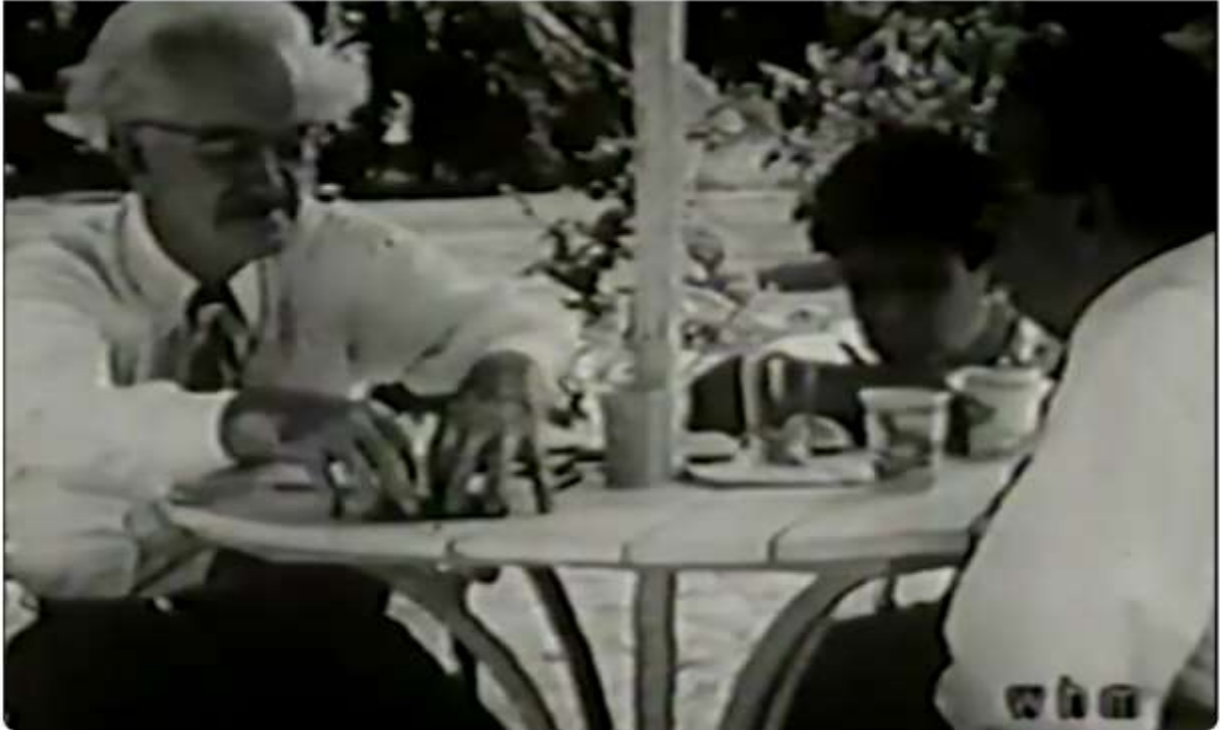
Harry Blackstone Sr.: A Glimpse into 1950s Magic