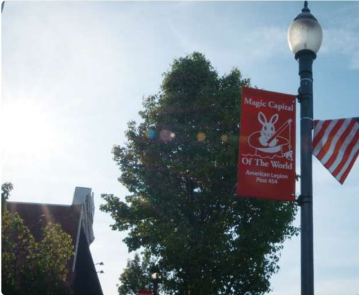
Welcome to the Magic Capital of the World

A reminder that the Abbotts Magic Get together is coming up in August.