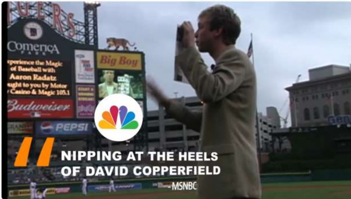
RADATZ MAGIC Grand Illusion Sizzle Reel