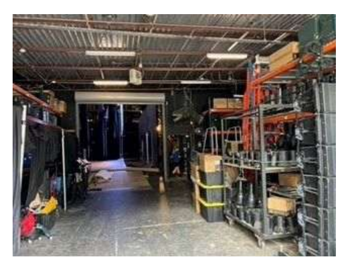
Backstage entrance and storage at Carowinds