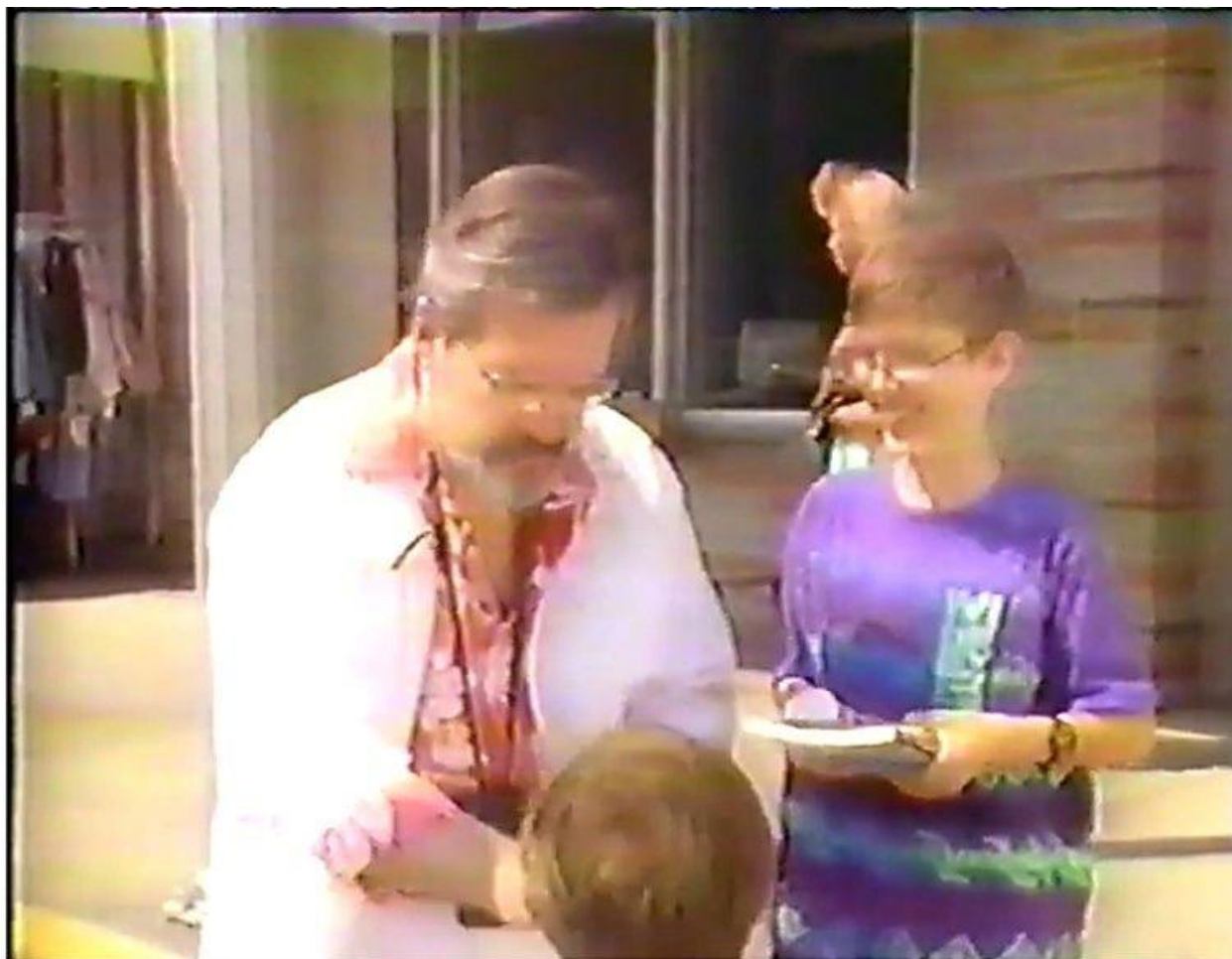
Abbott's Magic Get-Together - Colon, MI