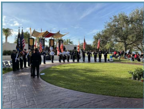
The color guard