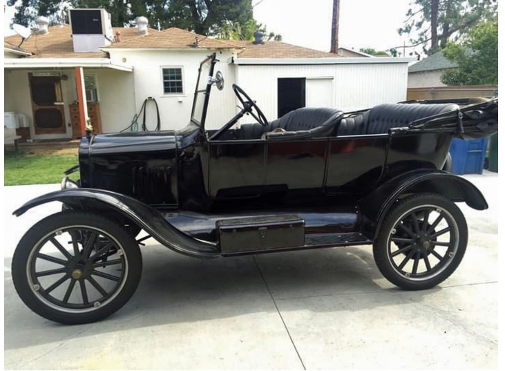
Ron Custer's 1924 Touring