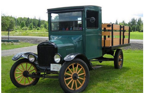
TT's with "C-Cab" and "Closed Cabs"

There were many competitors selling trucks at the time and many of these were better than Ford's, but Henry's business plan of keeping prices reasonable made the TT's very successful. Between 1917 and 1927 The Ford Motor Company produced more than one and one half million Model TT's.