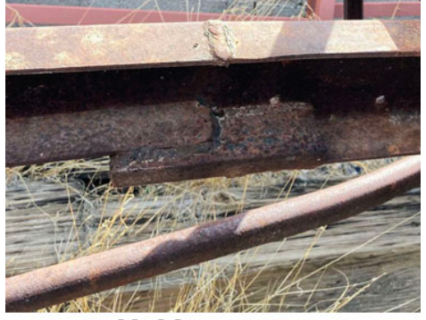
Welded frame extension

You don't see another Ford truck until 1905. That's when the Ford Motor Company took their Model C and made a "C" cab delivery body for it. Then in 1915 Ford made a delivery vehicle from the Model T. You may see many early years of Model T's as trucks, but it wasn't until 1917 that the Ford Motor Company officially made heavy duty trucks. Up until then, many third party manufacturers took the Model T passenger car chassis, cut and extended it's frame, changed out the rear differential, springs and wheels for heavy duty options and sometimes added a secondary transmission. These trucks are known as a Model T "conversions."