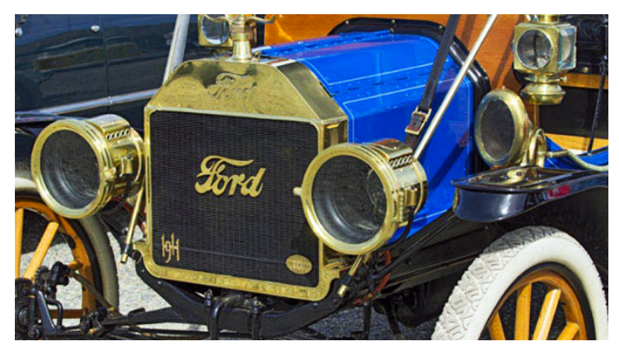
1914 Model T

Elden (Bill) Warren July 15, 1932 - July 4, 2022