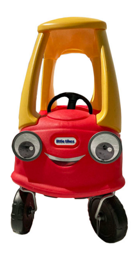
Doing our part for the gas crisis!

August 13 - South Point (indoor) September 10 - Orcutt, CA Ford Show September 16-18 - Mesquite Super Run October 7 & 8 - Henderson Hot Rod Days October 15 - Aerovault Open House October 15 & 16 - Southwest T Extravaganza October 22 - Armed Forces @ Craig Ranch October 28-30 - Concours Tour d'Elegance October 29 - Iron Mountain Parade October 30 - Trunk or Treat Centennial Library November 5 - Goldstrom's Classic Car Show