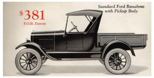
1926 Runabout Pickup