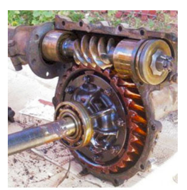
Worm drive differential

Of course the first three trucks from the Ford factory were also a type of conversion. They were offered as a chassis only and the customer supplied the body. In 1918 the first production, one-ton trucks, called the TT came out of the factory. They featured a two-foot longer wheelbase, heavier frame, double layer rear springs, larger rear tires and wheels and rear axle with worm drive. It frequently came equipped with an accessory gearbox and artillery style