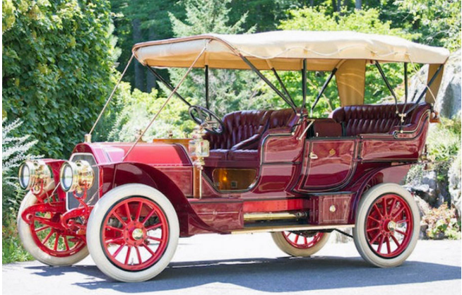
1906 American Tourist Roi-des-Belges