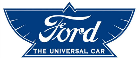
1912 Winged Pyramid