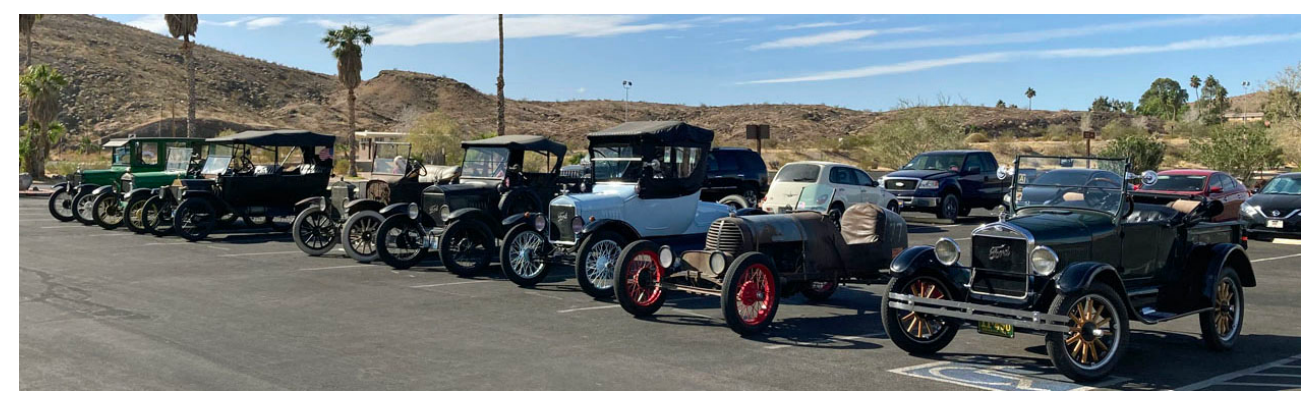
(see bonus pictures in your email for more "cars at Callville Bay")