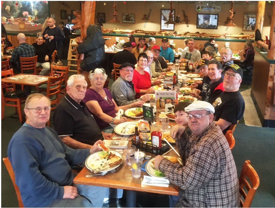
... and then it wasn't just T's.