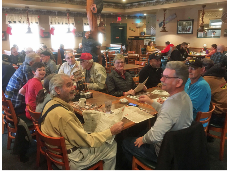
There were some diner's ...