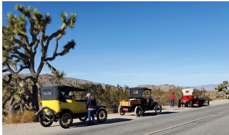
The Tour in Palm Desert