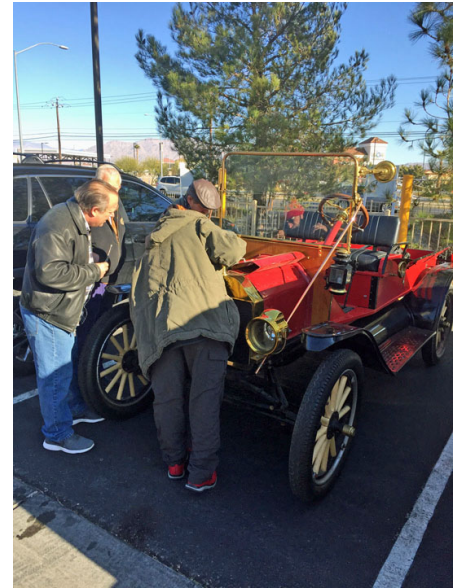
Tom's 1912 flatbed