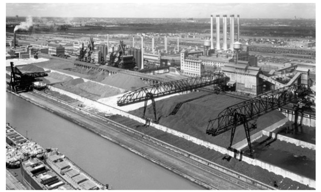
Rouge River Docks