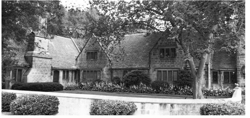
Edsel & Eleanor Ford House

The Rouge Factory didn't start out producing cars however, because of World War I. It first produced (besides Model T parts) the Eagle Boats used for anti-submarine warfare. The first production cars from The Rouge would be the Model A in the late 1920's. Other cars built at the Rouge were the 32's, the Mercury, Thunderbird, Capri and four decades of Mustangs. Today the facility produces F-150 trucks at the rate of one every 53 seconds.