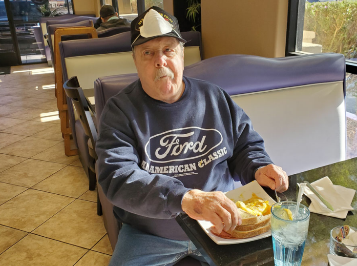
Living in Las Vegas, did you know churches accept gambling chips?

This may come as a surprise to you, but there are more Catholic Churches in Las Vegas than casinos. Some worshipers at Sunday services will give casino chips rather than cash when the basket is passed. Since the chips come from many different casinos and the casinos all have their own chips, the churches had to devise a method to sort the collected chips. The churches all send their chips to a nearby Franciscan Monastery where the chips are sorted then taken to the proper casino to be cashed in. This is done by The Chip Monks.