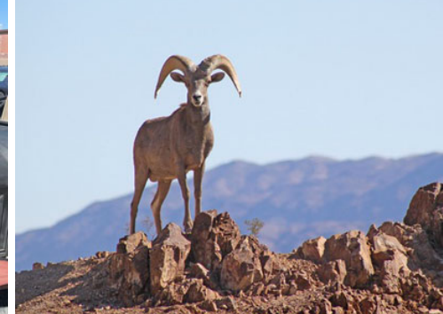
And Then There's Another "Damn" Tour!