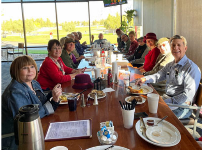
And Then There Are The Powers That Be: