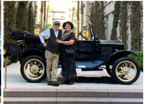
We Helped Make A Little Money For Charity At The "Discovery" Children's Museum $350,000 Not Bad For One Evening!