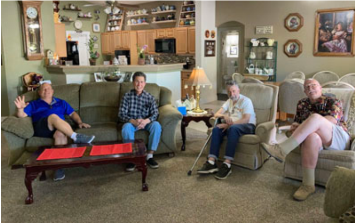
Everyone's Always Up For Ice Cream!