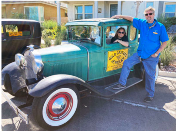
We Were A Hit At The Cadence "First Annual" Car Show