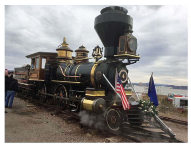
Or a Visit To The Eureka Palisade