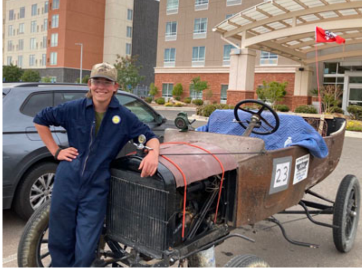
Utah Speedster Run