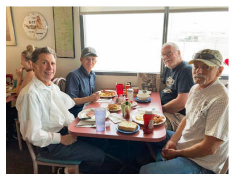
Despite a pandemic, we had breakfast almost every Saturday!