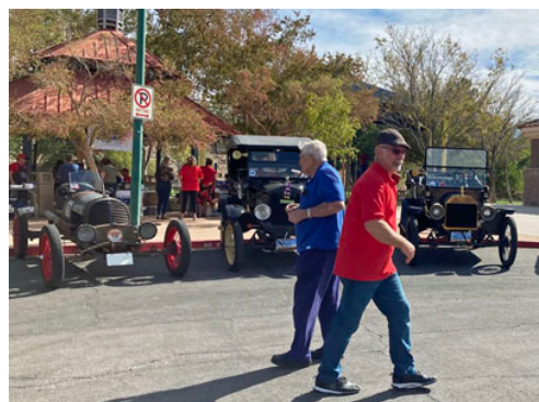
Taking Care Of An Old Car Is No Picnic, But You Can Go To One!