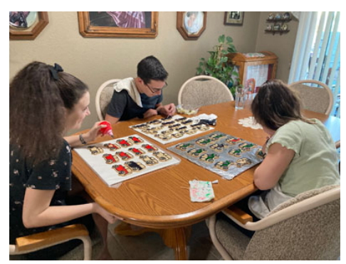
There's Nothing Like Some Good Christmas "Car" Cookies