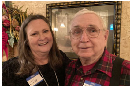
Christmas at Dean's Place