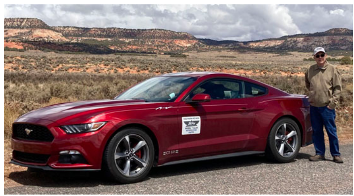
Utah Canyon Tour