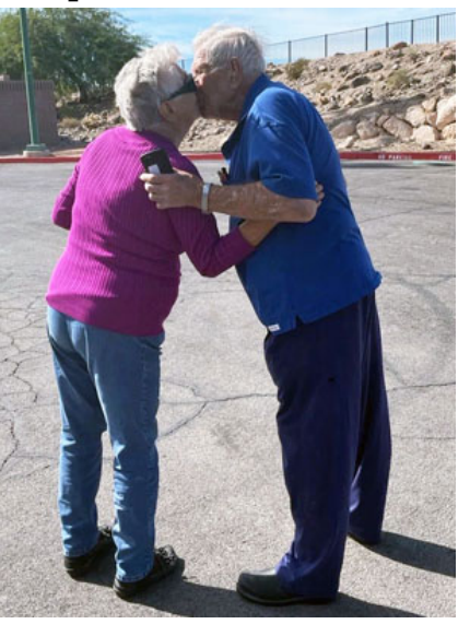
It's Not Just The Love Of T's That Keep Us Together!