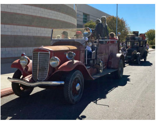
Off To The Iron Mountain Halloween Parade 3 T's, an A, an old Dodge and a Firetruck They Couldn't Have Done It Without Us!