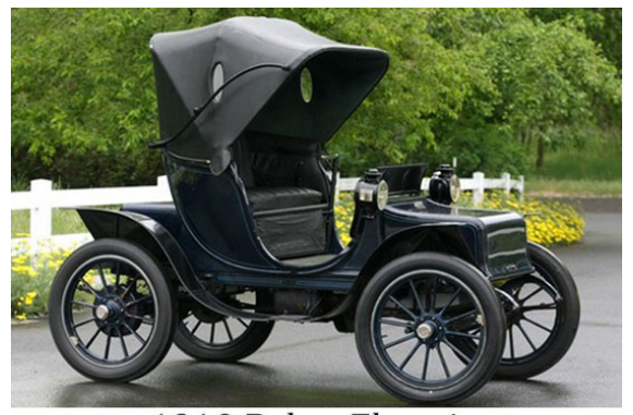
1910 Baker Electric