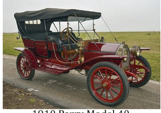
1910 Parry Model 40