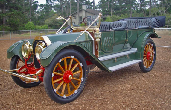
1910 Oldsmobile Limited