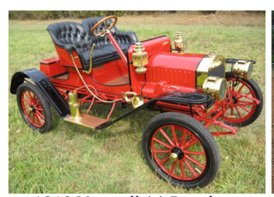
1910 Maxwell AA Runabout