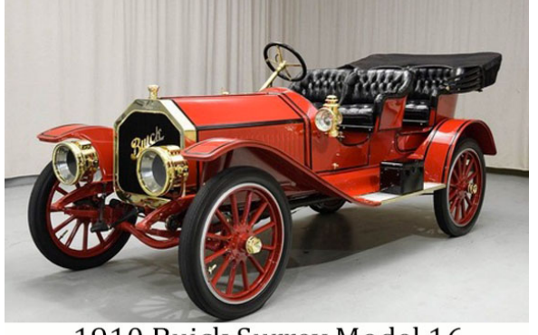
1910 Buick Surrey Model 16