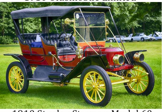
1910 Stanley Steamer Model 60