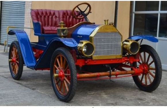
1910 Brush E-24