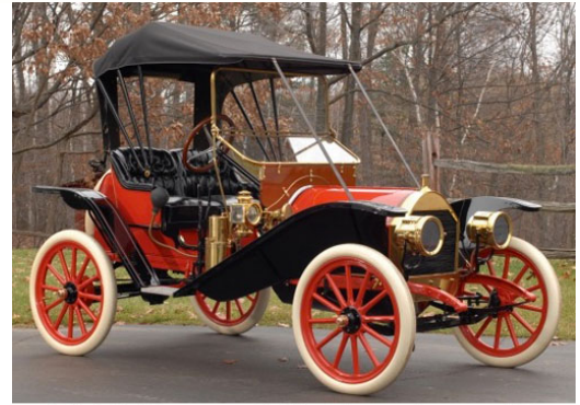
1910 Hupmobile Runabout 20