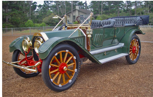
1910 Oldsmobile Limited