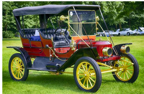
1910 Stanley Steamer Model 60