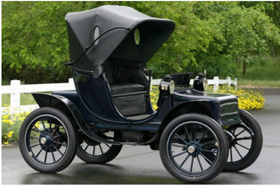
1910 Baker Electric