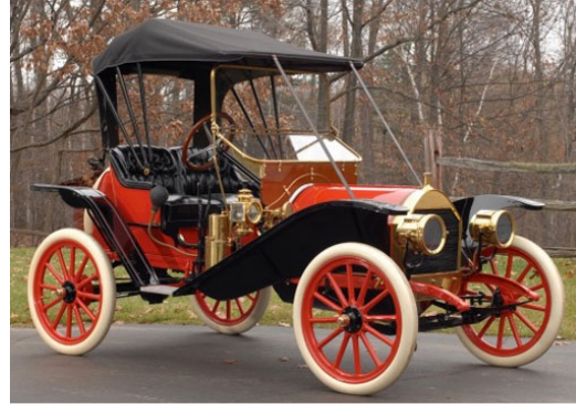
1910 Hupmobile Runabout 20