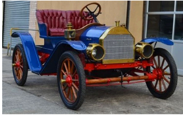
1910 Brush E-24