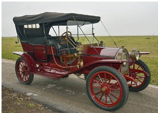
1910 Parry Model 40