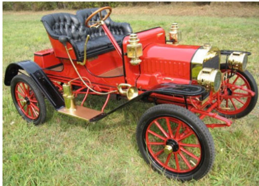
1910 Maxwell AA Runabout