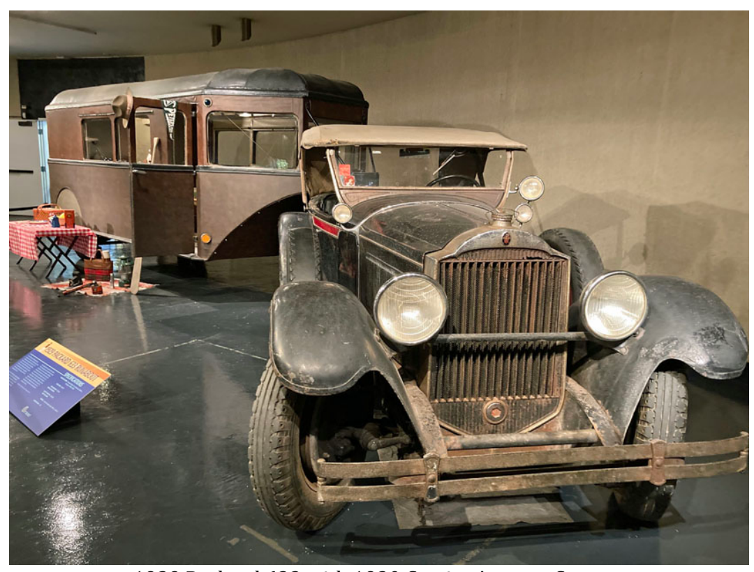
1929 Packard 633 with 1930 Curtiss Aerocar Camper