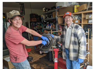
"Another fine mess you've gotten us into, Ollie!"