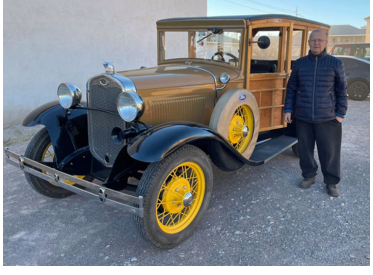
T's and an A at the Airport