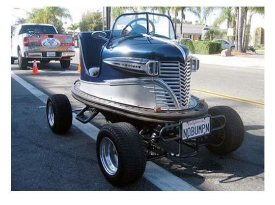
I want one!